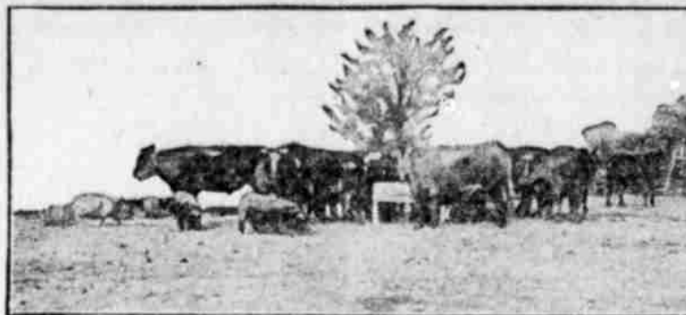
Cattle in an Illinois Feeding Lot.