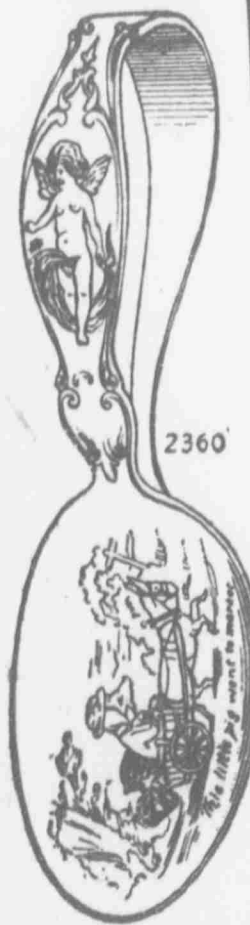
No. 2360 Baby Spoon $2.50