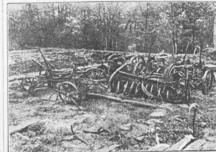
A Moment's Carelessness May Reduce a Fine Property to Ruins.

The purebred sire is better than the grade. So is the purebred female.