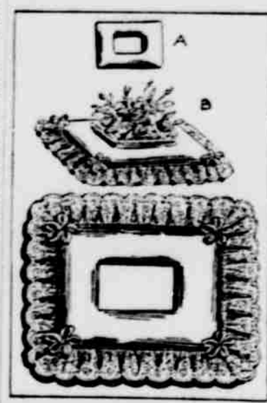
Novelty for the Dressing Table.

The pincushion from which our eketch was drawn was of the shape shown h diagram A. on the right of the Wustration, and it was covered with cream satin edged with a fine wilk cord and trimmed with lace. In each corner there was a little bunch of very narrow ribbit matching exactly the color of the rord. The left band sketch clearly shows the way in which the cushion should be made and