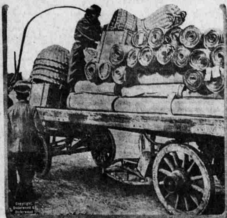
Germany is safeguarding its interior against further bolshevik uprisings. Here on Mannheim bridge a German policeman in civilian clothes is searching the wagon of a smuggler for contraband.

Papeete, Island of Tahiti, May 31.—(By mail.)—Walking over stones heated white hot is the recent experience of an English newspaper correspondent who makes his home here. He emerged without injury or the slightest trace of fire on shoes or clothing and said he felt no discomfort whatever. He participated in the ceremony of "passing through fire," or "Umiti" as it is called by the Tahitians. Whatever trick there may be in performing this ceremonial is a secret religiously held by a small clan of natives on the island of Raiatea. A large pit is dug in which are placed huge, dry logs of wood overlaid with a thick layer of large river