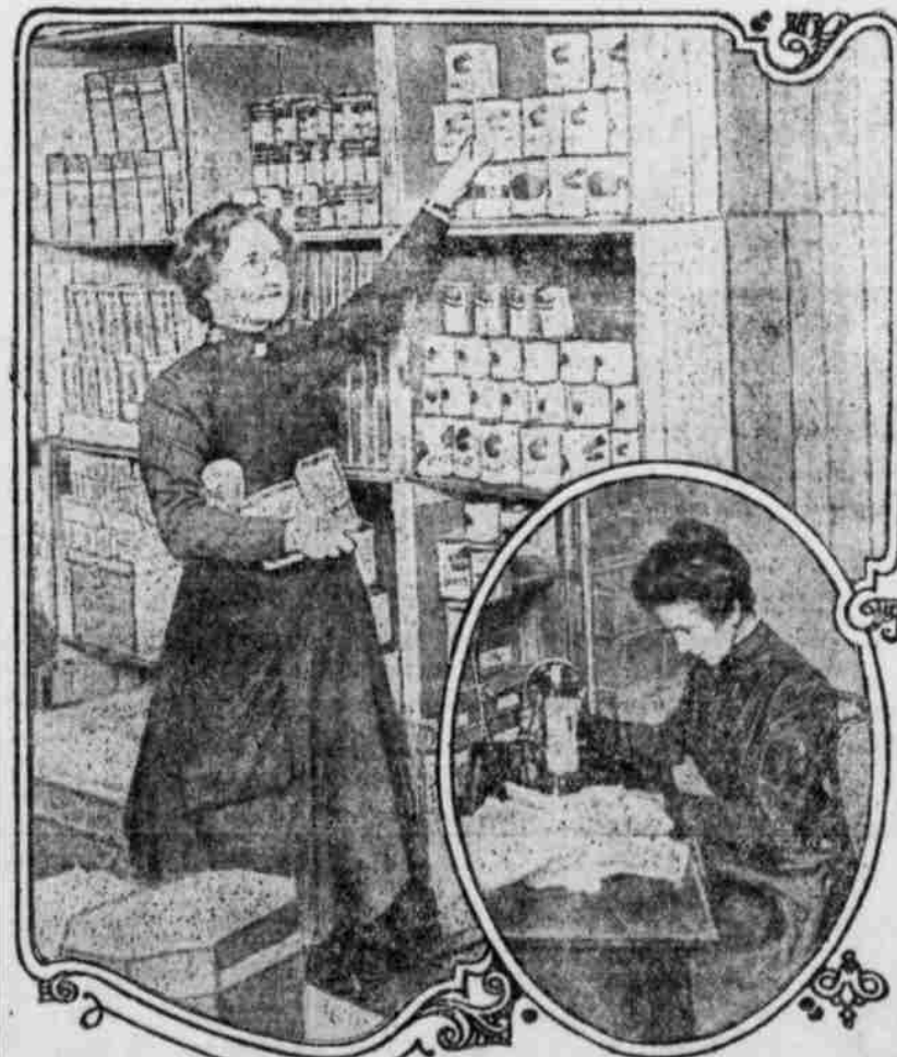
A RELIEF SUPPLY DEPOT