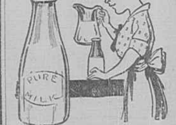
NEW YEARS COMES BUT ONCE A YEAR

make your New Year goody sips with cream from a responsible house. Use plenty of Juneau Dairy milk with it; you may not be wealthy but you will be healthy and wise. It saves many a stomach trouble in older folks. Why not have the best milk as well as the most economical. Mother can we have whip cream cake for New Years? Sure.