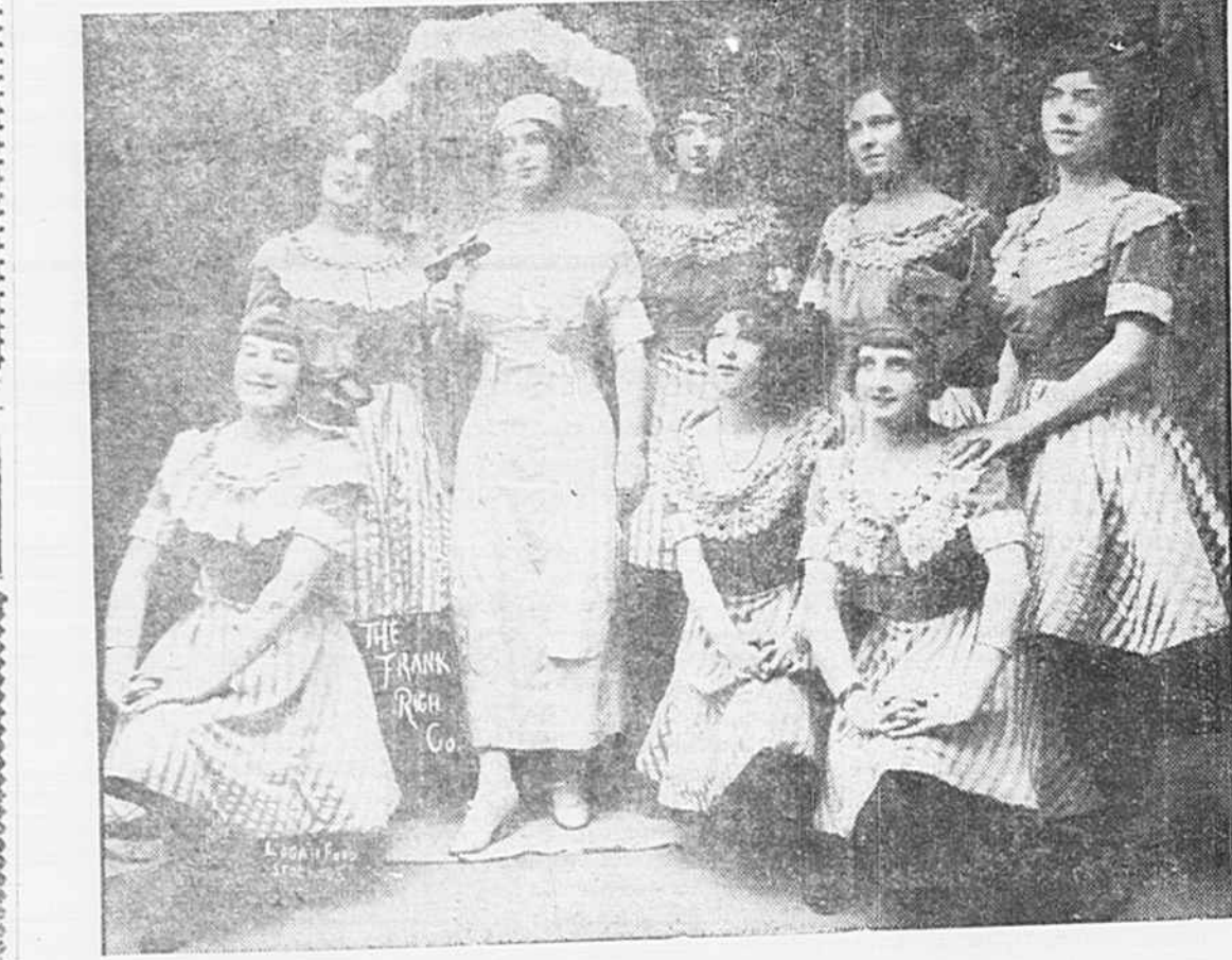
FRANK RICH COMPANY'S SUNSHINE GIRLS