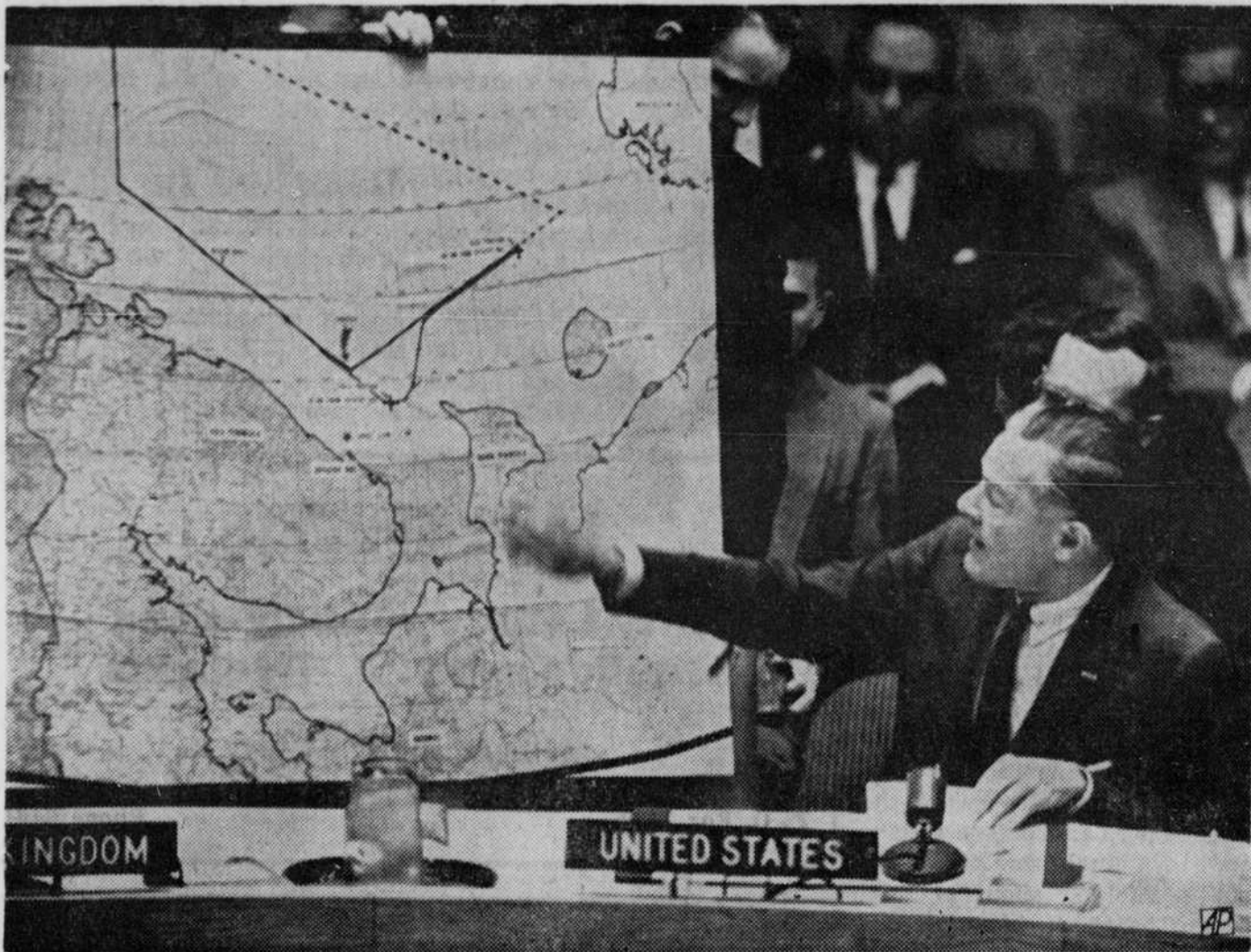
MAKING A POINT AT U. N.— U. S. delegate Henry Cabot Lodge points to chart as he tells the United Nations Security Council in New York Monday that the U. S. has proof that Soviet fighters deliberately pushed an American RB47 plane off its course and shot it down over international waters. Lodge introduced charts to demonstrate his point. Soviet Union charged that the plane was on a spy mission over Soviet territory when it was shot down July 1.