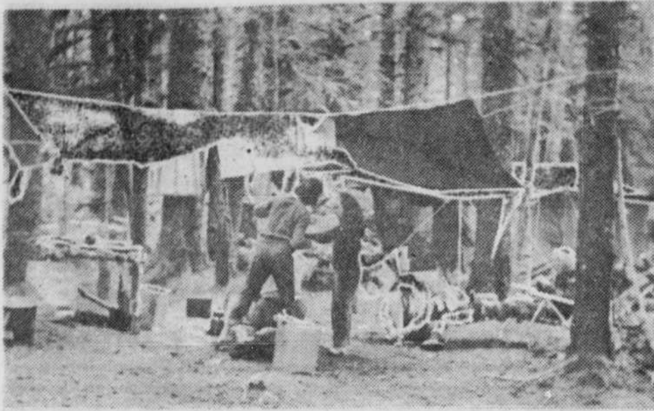
Shelters are being erected over the cooking fires and tables at the Girl Scout Camp. The girls cleared the brush and debris from the campsite. They did all the cooking and chopped most of the wood used, and carried water from the lake. The fathers erected the tents.