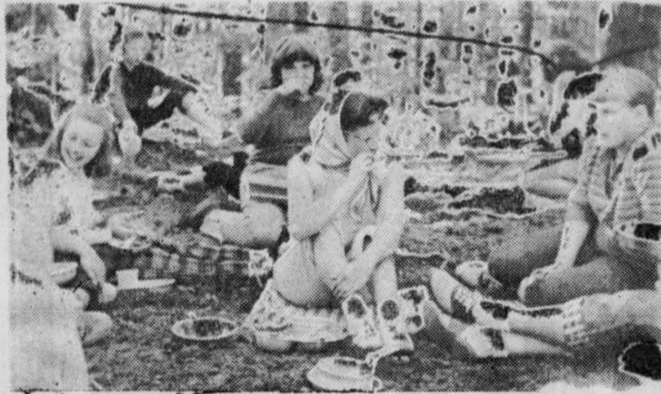
It's chow time at the Island Lake Girl Scout Camp.