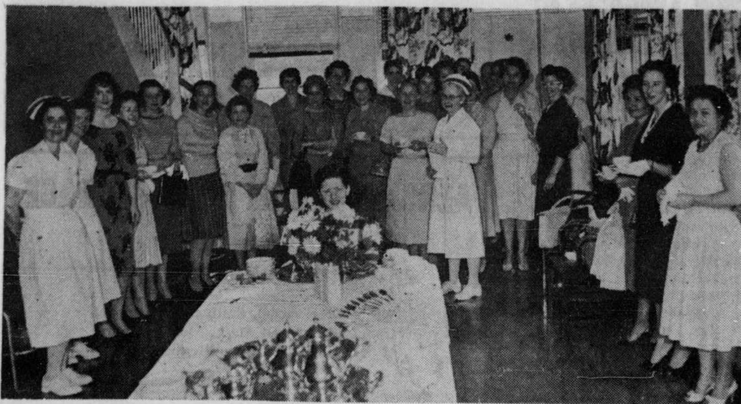
Ladies of the Naval Officers' Wives Club who were invited for coffee at the Naval Base Hospital by the hospital staff in celebration of the dedication of the new pediatric room.