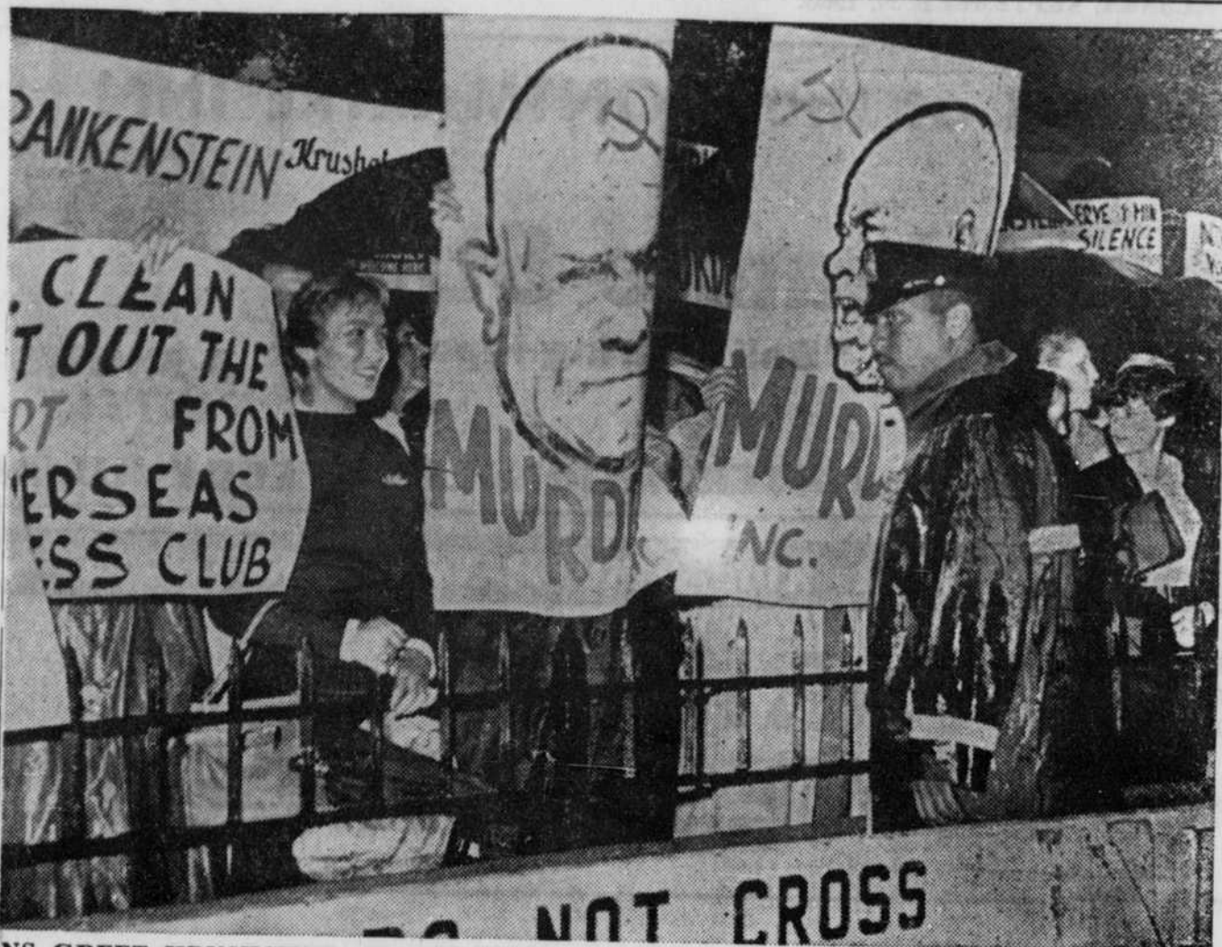
SIGNS GREET KRUSHCHEV —Here are some of the signs and posters which were displayed across street from the East River pier where Soviet Premier Nikita Krushchev docked on arrival in New York.