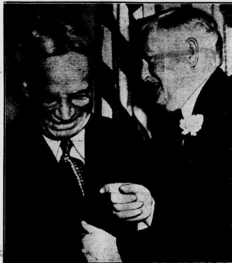
Senator Hiram Johnson (left) and Vice President Garner appear to have a jolly time recalling "way back when"—or perhaps it's a pleasant prediction for the future—as the Texan congratulates the Californian on his 20 years of service in the Senate.