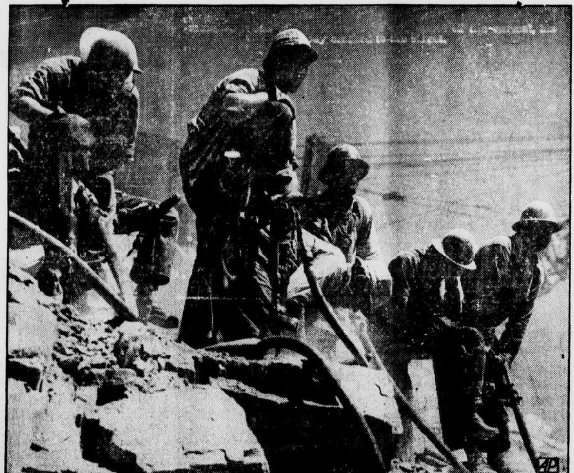
DRILLMASTERS AT WORK , boring thousands of holes into the bedrock at Grand Coulee Dam in Washington, are awaiting arrival of President Roosevelt on an inspection trip to the project. Also included on the itinerary of the chief executive is a visit to the Columbia river Bonneville Dam. Workers using air-driven jackhammers have drilled 760 miles of holes at Grand Coulee to provide a base for the 25 million ton structure.

ALLYN WATER DELIVERY FOR PROMPT SERVICE SOFT WATER Delivered at Current Prices FULL BUCKETS COMMENSURATE WITH NEATNESS CLIFF ALLYN, Prop.