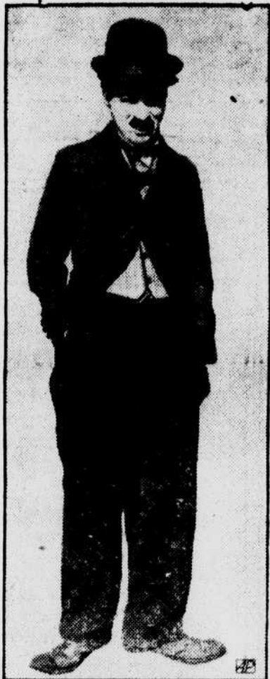
A STAR IS GONE from the cinema firmament, for Charlie Chaplin has announced the little tramp with baggy pants and big feet is