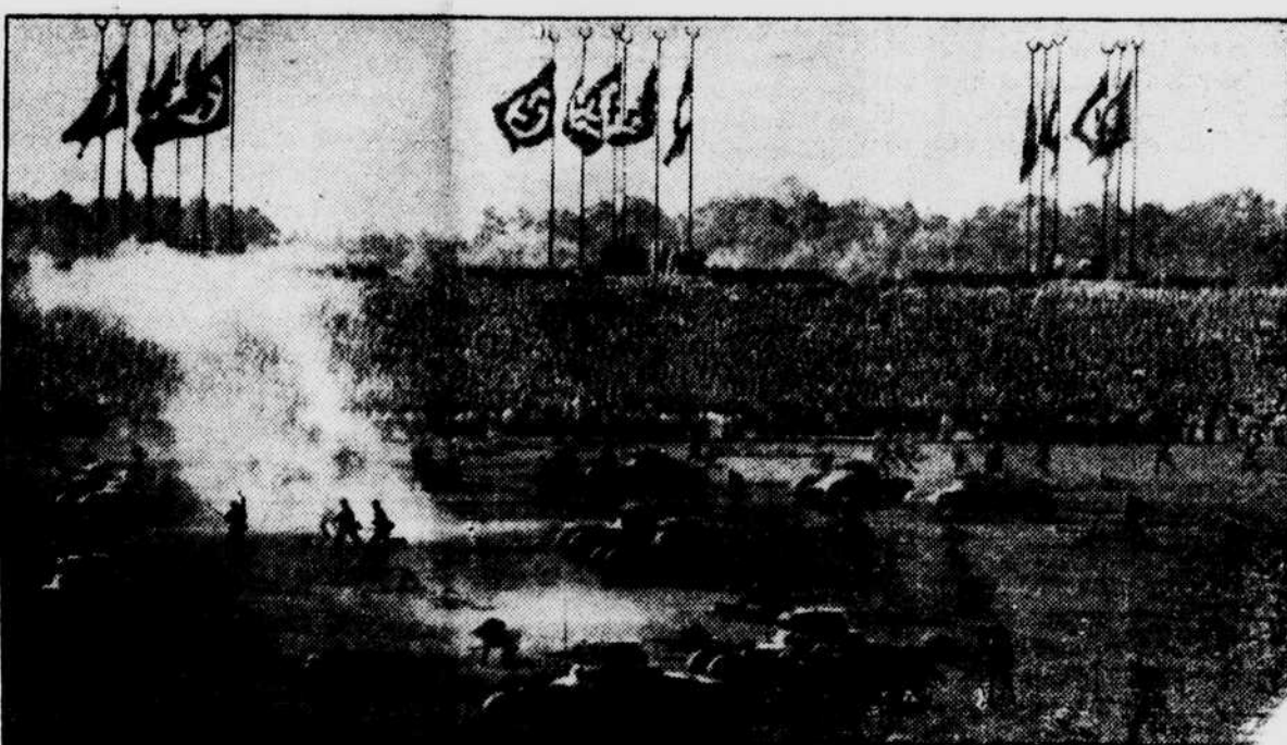
THE HEIL-LAND FLING of troops and tanks across a sham battlefield was staged as Germany paraded her military might before Chancellor Adolf Hitler. Thousands of Nazis massed at Nuremberg to witness the drama of war in huge Zeppelin stadium. Following this the army plunged into a week of maneuvers in northern provinces. Cloaked in deepest secrecy, they were the Reich's greatest since war days.

Mussolini says all his thoughts are bent on preventing war. Not bent, Duce, just plain warped.