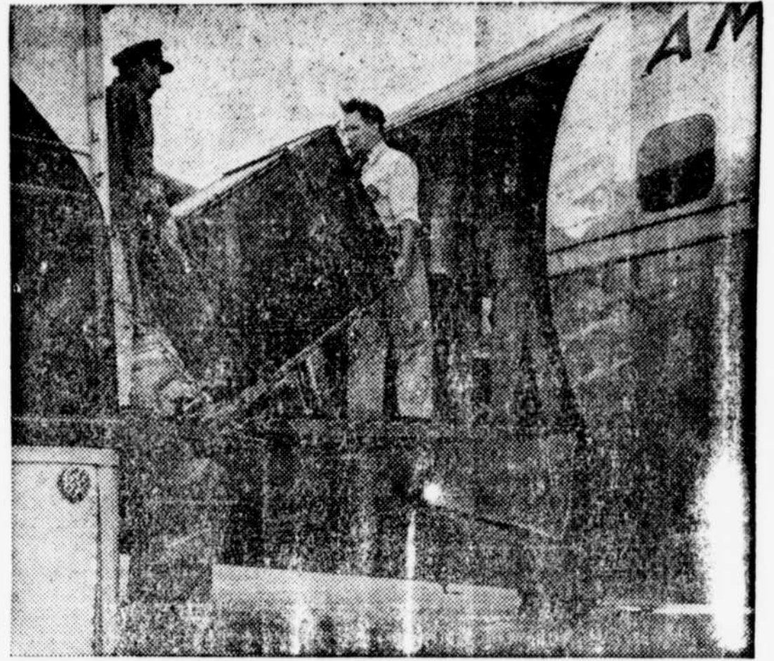
FURNITURE BY PLANE —Furnishings of a 16-room house, weighing 18,000 pounds, recently were moved across the continent by overnight plane. Manhattan warehouse employees load goods for the flight to Los Angeles.