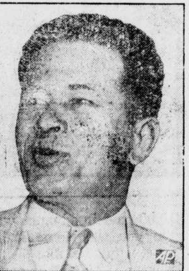
IN POLITICS during debate on compulsory tobacco and rice control, Senator Allen Ellender (above), successor to Huey Long, declared, "Down in Louisiana we believe in doing things in a democratic way."