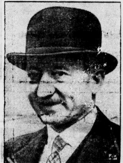
IN DIPLOMACY French Foreign Minister Yvon Delbos (above) announced after conference in London plans for broad consultations with other powers looking toward general settlement of world unrest.