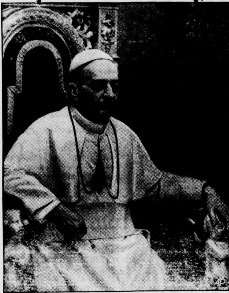
HE BATTLES ILLNESS to carry on the papal duties. Here is an exclusive Associated Press photo of Pope Pius XI, his most recent portrait, which shows clearly the strain recent poor health has imposed upon him. Just a year ago the pontiff was critically ill, but rallied against great odds.

Are you taking advantage of six months paid in advance subscription?