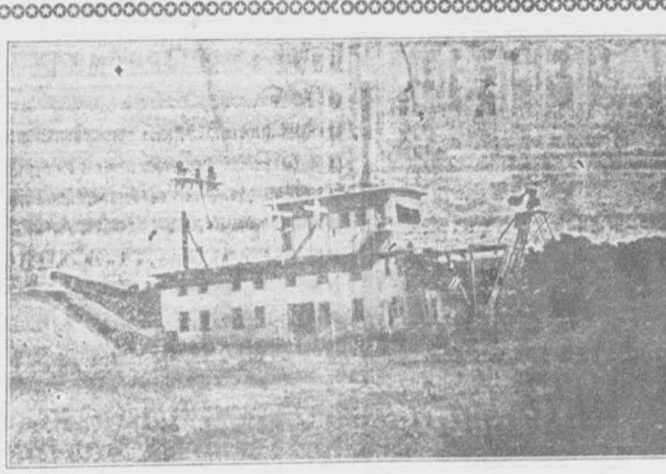
AMERICAN GOLD DREDGES—TYPE OF AMERICAN GOLD DREDGE OPERATING AT NOME

Leading Builders of Smaller Sized Dredges with buckets 1 1/4 to 5 cubic foot capacity