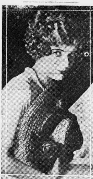
MOVIE STAR TO START MILK FARM

FRENCH LICK, Ind., June 26.—Senator McKellar, democrat, declares that neither party will have a plank in its platform on the liquor question. He says no wet or dry candidate can be nominated for President on the Democratic ticket.