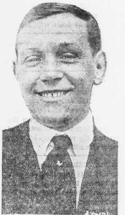
JIMMY WILDE Former Flyweight Champion

From the first round it was plain that Villa would be the new champion Wilde failed to show any signs of retaining his title but despite being defeated from the start of his fight by his opponent's vicious punches he never gave up hope, always trying desperately to land one of his famous blows on Villa's jaw. However, the little brown man proved too clever and the once noted boxer went down, fighting courageously like a hero.