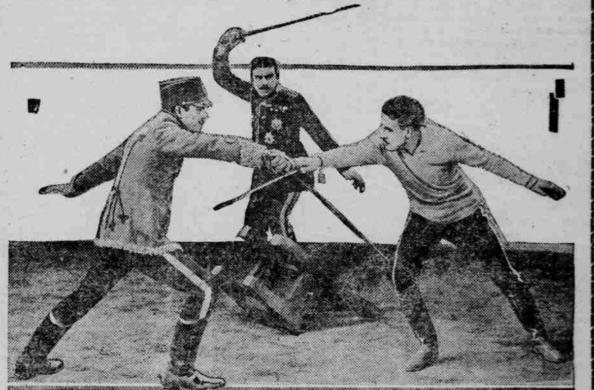
One of Many Exciting Scenes From THE PRISONER OF ZENDA

Another example of the motion picture supreme by the man who directed "THE FOUR HORSEMEN"