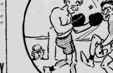
GEORGES CARPENTIER FEELS THAT A JOLT ON THE JOB AT $1000 A MINUTE - IS PREFERABLE TO THIS AT $20 A DAY