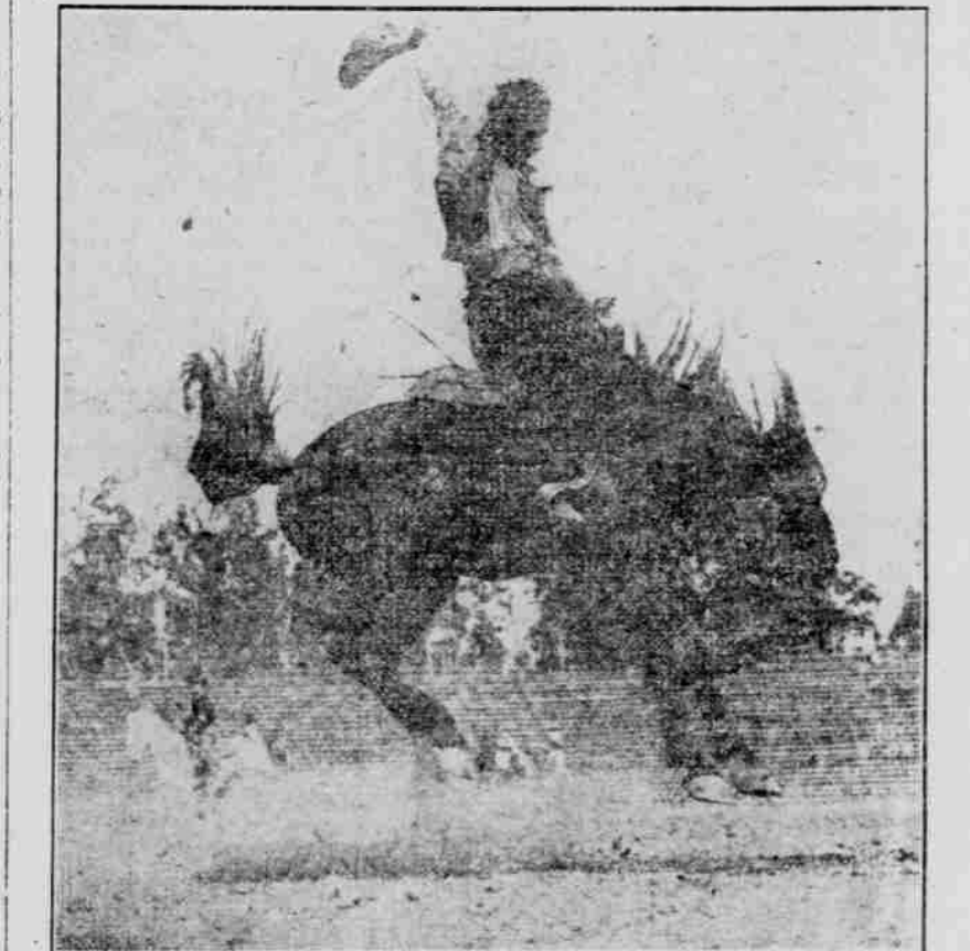
"Ride 'em cowboy, ride 'em ragged"

"Stay Cowboy," the slogan of the auto and motorcycle racing will be Prescott Frontier celebration July 3, 4 and 5th, may mean several different things all at the same time. Prior to the celebration, which is just at the present time, it is through at the punchers to get them to "come up a mile and ride awhile," but at the celebration, it is used mainly when a stalwart rider mounts a particularly vicious brute imbued with the idea that no mere man can stay on the days will be reverted to. The course is already being prepared for the speed dike. Some of the best drivers in the state and adjoining territory are sure coming. Special rates on the Santa Fa are being negotiated, and Prescott is bound to keep up their record of showing all visitors a big grand time. The by gone period of the old catch-