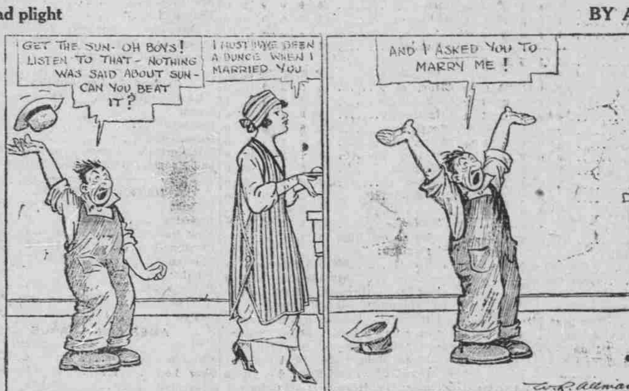
What a sad plight