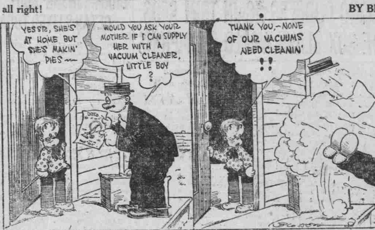
He answered all right!