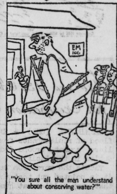
"You sure all the men understand about conserving water?"