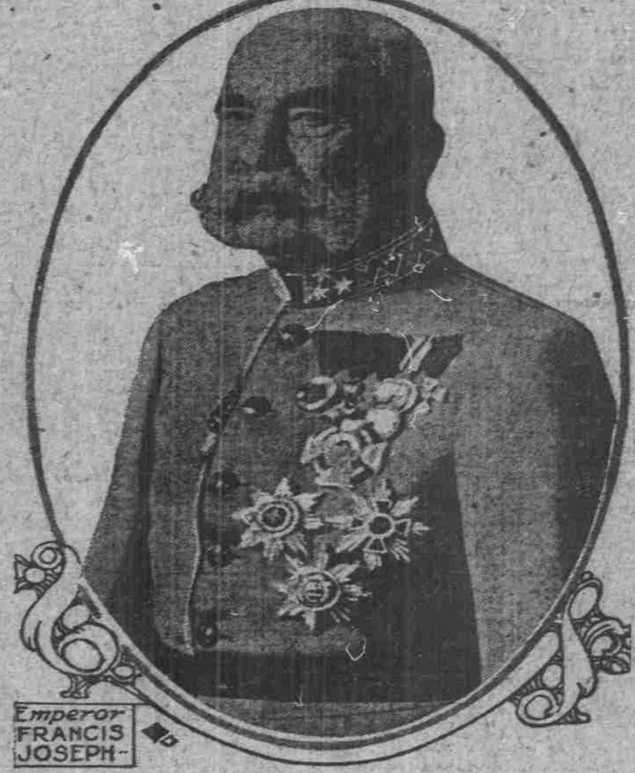
Emperor FRANCIS JOSEPH. Vienna, July 1.—The assassination of Archduke Francis Ferdinand and his wife has been a hard blow to Emperor Francis Joseph.