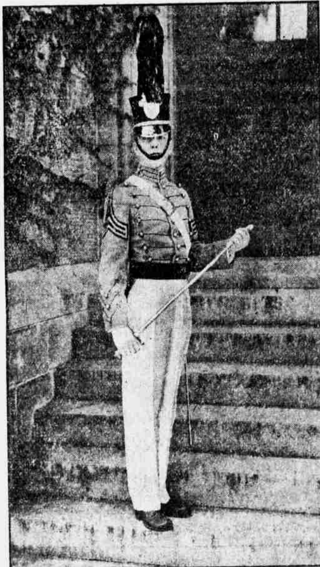
In Richard Barthelmess's newest picture, on which he is now working, together with his leading lady, Madge Evans, former child actress, Dick dons the garb of a West Point cadet and wears it throughout the film. Seems to us that Dick looks mighty snappy in these togs. Don't you agree?