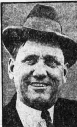
The attack of Smith W. Brookhart (above), senator from Iowa, on Brig. Gen. Charles Dawes, President Coolidge's running mate, will probably lead to his expulsion from the Iowa Republican party.