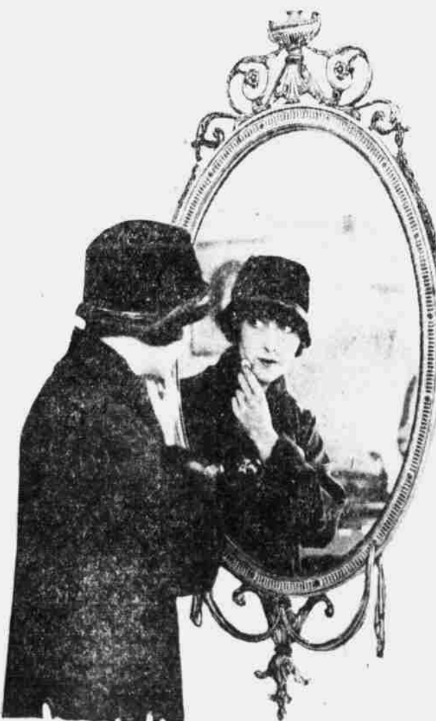
After doling up in her hotel in New York, Florence Vidor (above), star of the silver screen, talked to reporters and denied intention to marry Director George Fitzmaurice.