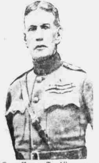
Gen. Henry T. Allen, commander of our army of occupation in Germany following the armistice, returned recently from Geneva where he witnessed sessions of the League of Nations. He endorsed the Benes protocol and the league in general.