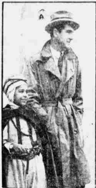
Rex Ingram, the director, was one of many notables of the moving picture world that sailed from New York for Europe recently. He took this little Arab with him as a companion.