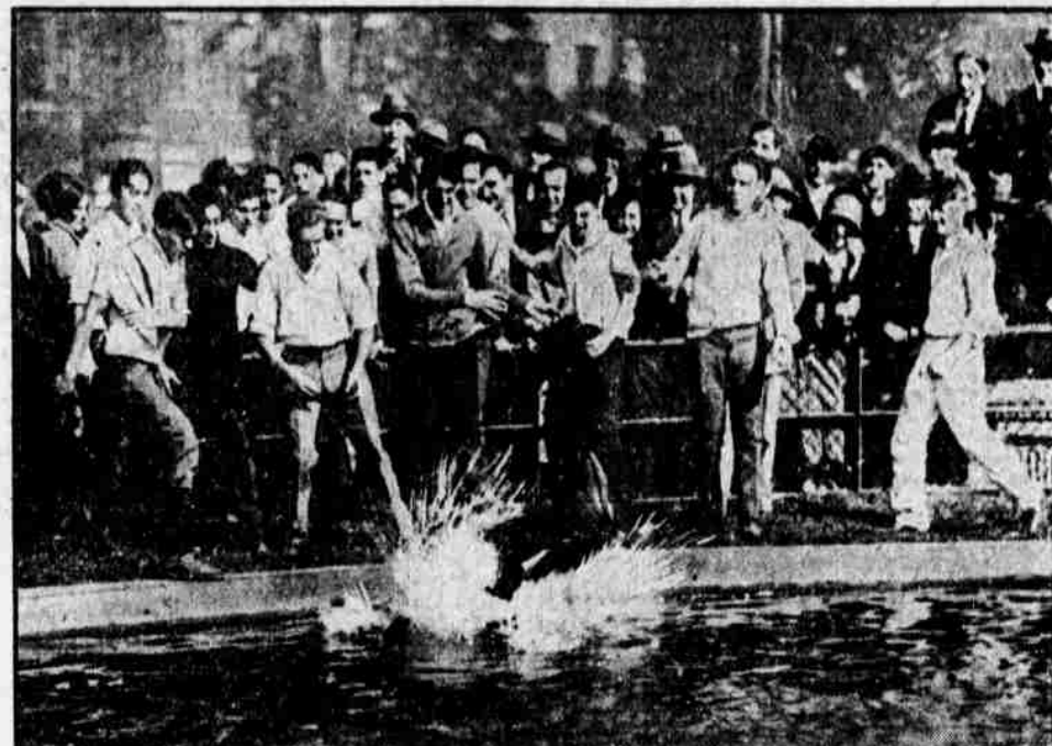
No, it wasn't Saturday, but luckless New York university freshmen took a bath just the same. Sophomores ushered them into fountain. "Wasn't comfortable, but, at that, weather might have been colder."