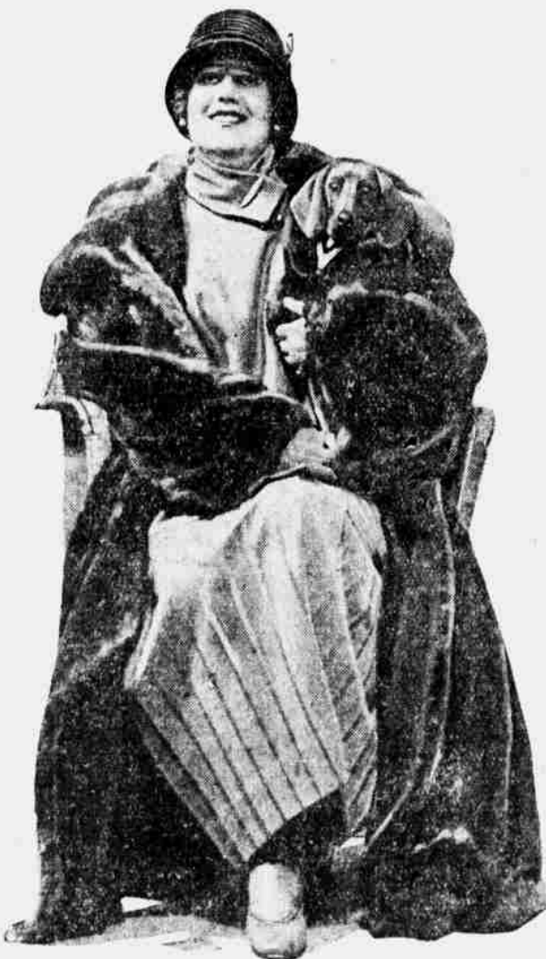
Beautiful of face and ample of form as ever, Jeritza, opera star, returned to New York from vacation in Europe with dachshund pet, aboard Majestic. Mme. Jeritza's first request after six months in Europe was for some fresh juicy oysters.