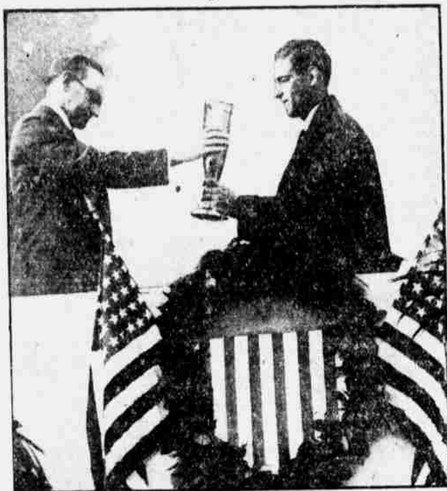
"Good boy, Buck!" President Coolidge may not have used those exact words when he presented cup to Stanley Harris, manager of the Washington baseball team, but that's what he meant. First time a President ever had a chance to so reward the Senators.