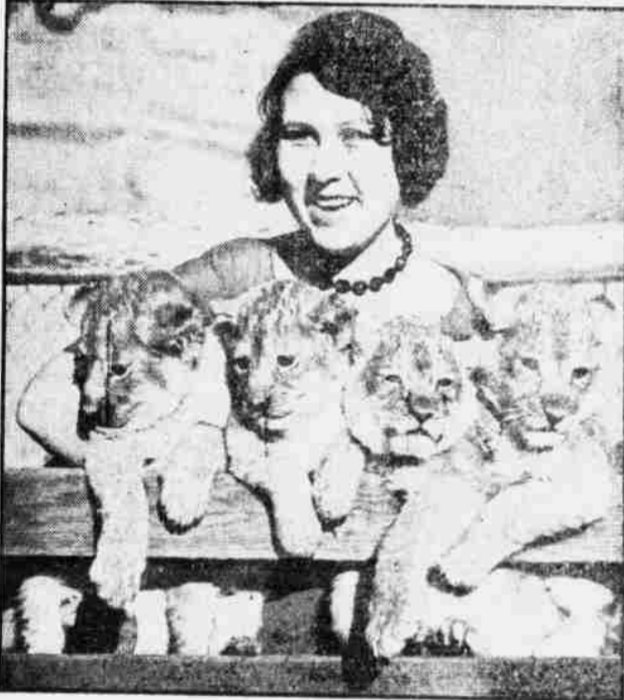
Lioness Has Family of Four

These four healthy cubs in the arms of this pretty miss comprise the latest addition to the family of Gladys, famous lioness at the San Diego, Cal., zoo.