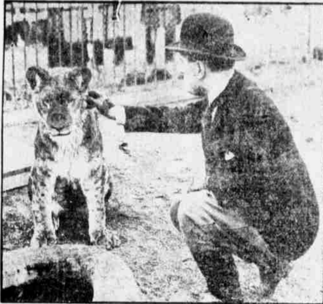
Italy's Modern Daniel

Not having enough trouble on his hands, Premier Mussolini of Italy goes into a lions' den, but it's his own den and the lion cubs are his peculiar pets.