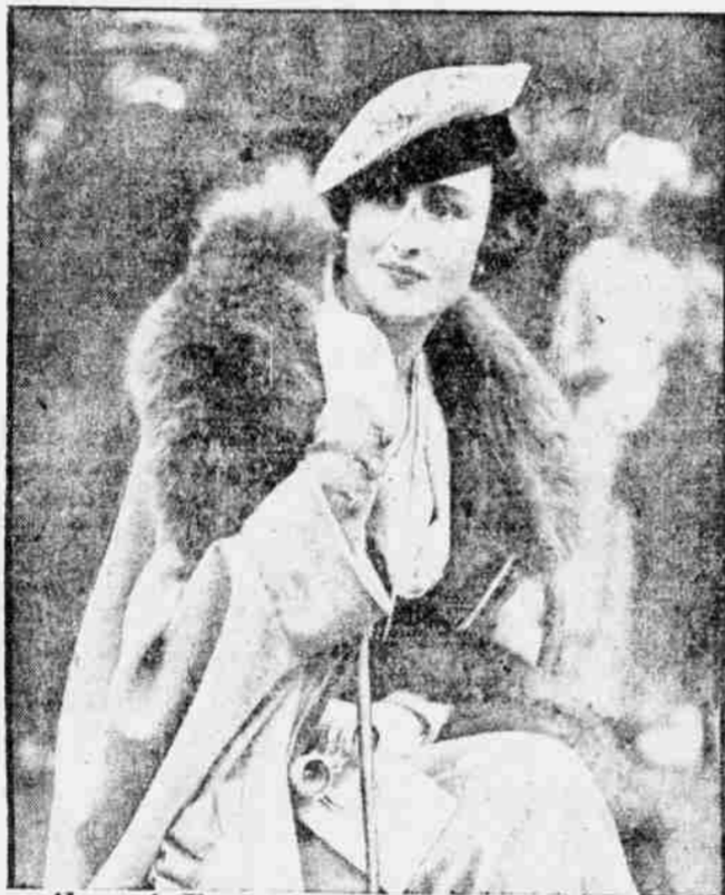
Mother of Twins