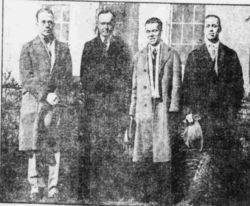
Cal Rings Curtain on Bell-Bottom Trousers