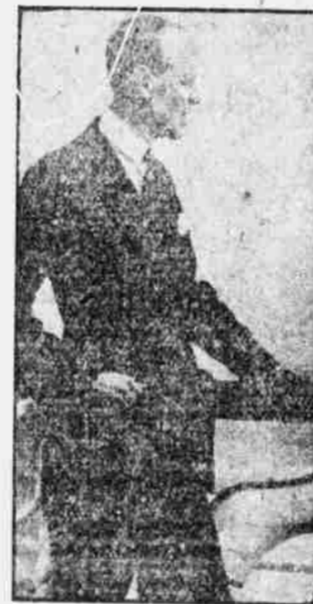
In United States