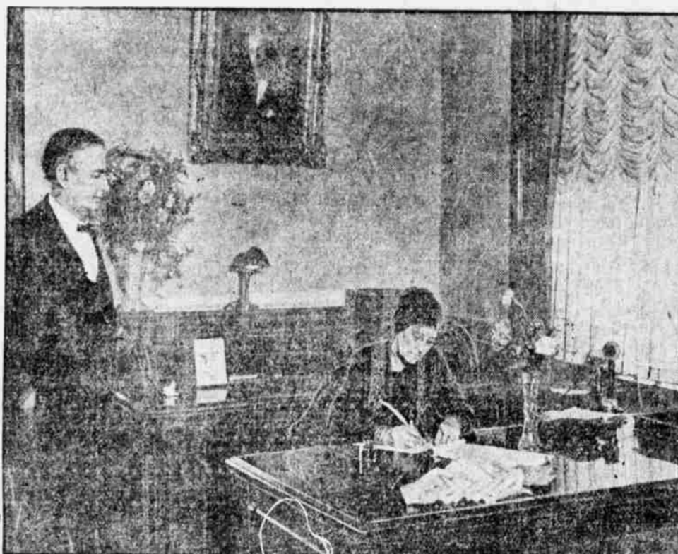
With Ma at Helm of Ship of State

Having been sworn in as executive of Texas, Gov. Miriam A. Ferguson, better known as Ma, is shown signing first message to Texas senate, while husband, former Gov. James E. Ferguson, looked on.