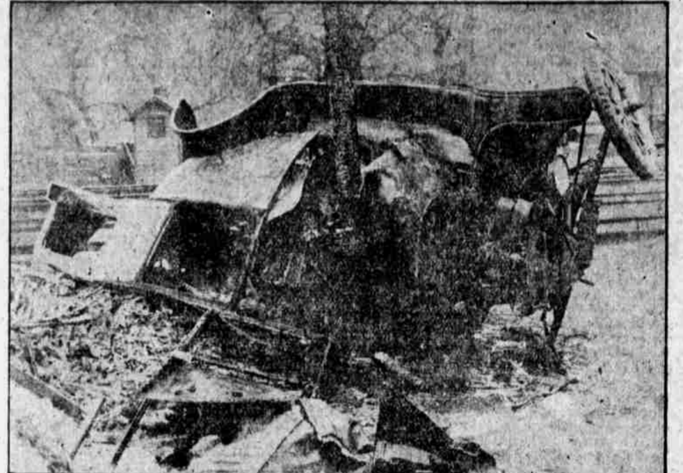
Three Die When Train and Auto Crash

When auto crashed through crossing gates at Rochester, N. Y., one woman and two men were killed in crash with freight train.