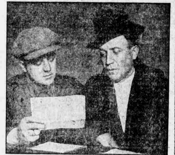
Caught in the End