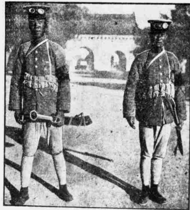
Chinese troops and their beheading swords.