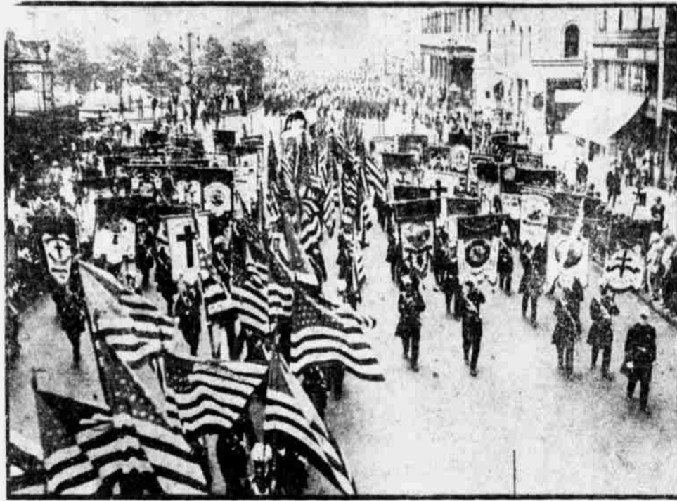
Fifth ave., New York, was a riot of color as fifteen thousand members of the Grand Commandery of Knights Templars paraded in their brightest plumage. It was the opening of the 112th convolve. The knights are in convention in New York City for the first time in fifty years.