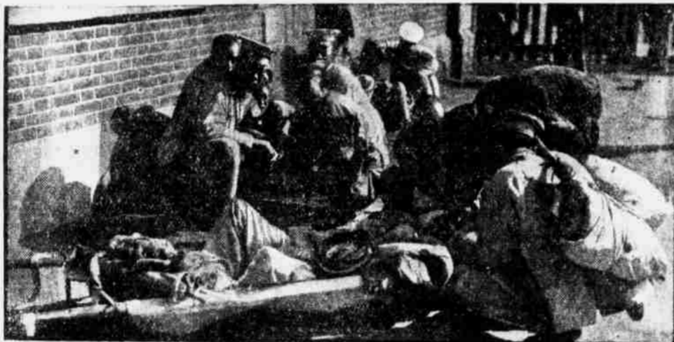
Wounded being brought in from the firing line in China's civil war.