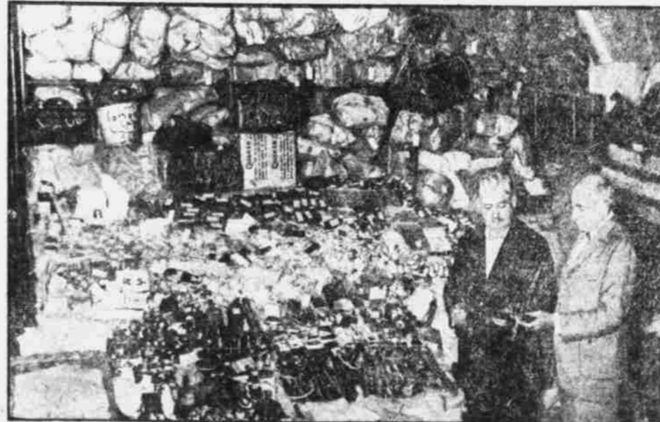
Narcotic drugs valued at $1,500,000 were burned in furnace at police headquarters in New York by members of the narcotic division. They were seized during the year in raids by police. Police Commissioner Enright (left) and Deputy Commissioner Dr. Carleton Simon are shown examining opium pipe.