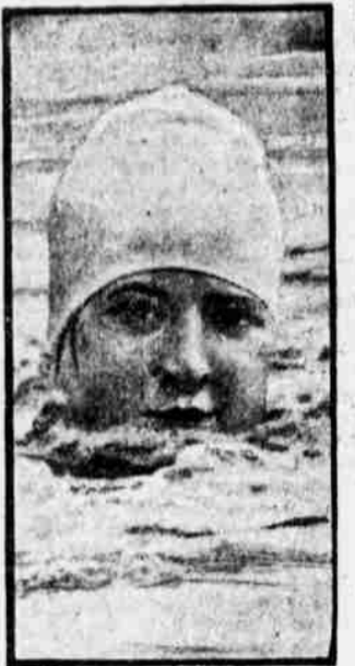
Gertrude Ederle swam twenty-one miles from New York city to Sandy Hook in New York Bay in 7 hours 11 minutes to exhibit the speed and endurance she hopes will enable her to conquer the English Channel next month.