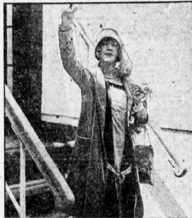
A bare five minutes before sailing time, diminutive Fanny Ward, actress, made appearance on deck of liner Majestic for sojourn abroad. Mistaken passport nearly caused postponement of trip.