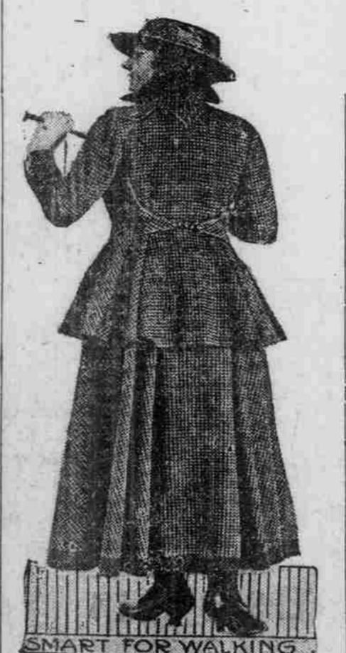
SMART FOR WALKING