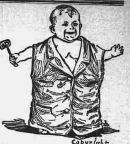
Copyright 1890. A small investment.

American Steam Laundry. The only place in the city where the Winnie Collar is done up properly.