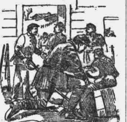
THE MAJOR HELD A CAN OF WATER TO HIS LIPS.