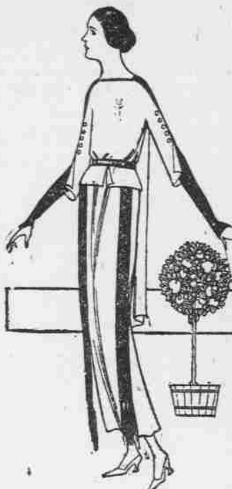
Afternoon Gown of Navy Blue Tricotine and Black Satin

There are some types of women who simply can't wear the regulation fashionable lines. They look as though the gown was taken off the shelf and stuck on them, regardless of their needs. Madam is sensitive to this type, and rebels against such persons wearing latest style models.