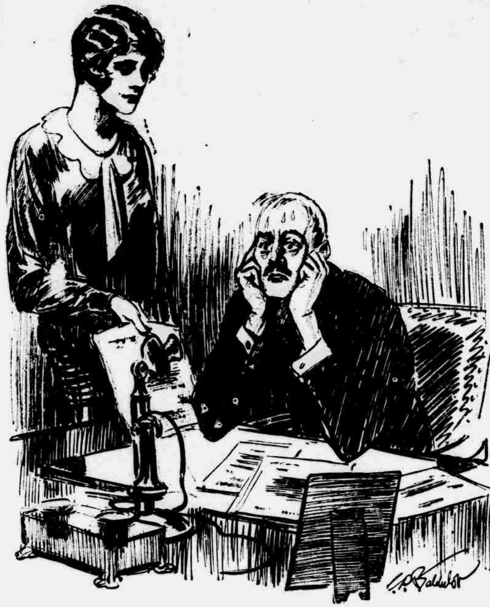
"Mr. Jones, it can't be as bad as all that." "It is, though. I called up Mrs. Jones, swore at her for five minutes and then to my horror discovered it was the maid."