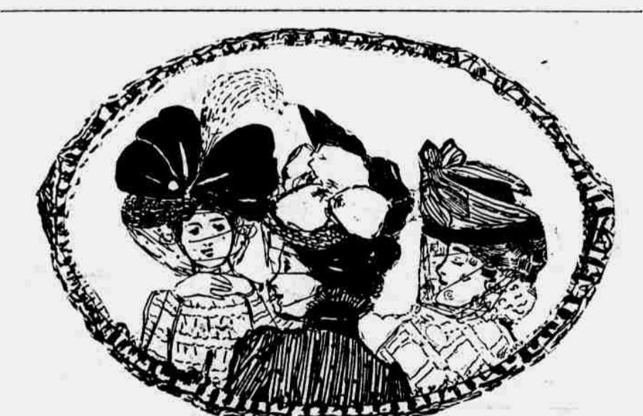
THE SHAMROCK HAT CONSISTS OF FOUR CURIOUS LEAVES SET WELL FRONT OVER A SPREADING CROWN; THE ROSE HAT IS IN VELVET AND THE ORCHID HAT IS IN STRIPED-SILK.