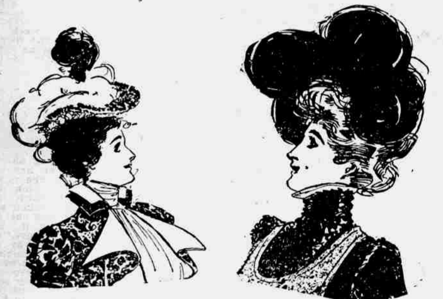
THE ERA OF STREAMERS HAS ARRIVED AND YOU SEE THEM OF ALL DESCRIPTIONS FROM HEAVY VELVET TO THE LIGHTEST OF TULLE, CHIFFON AND VEILING.