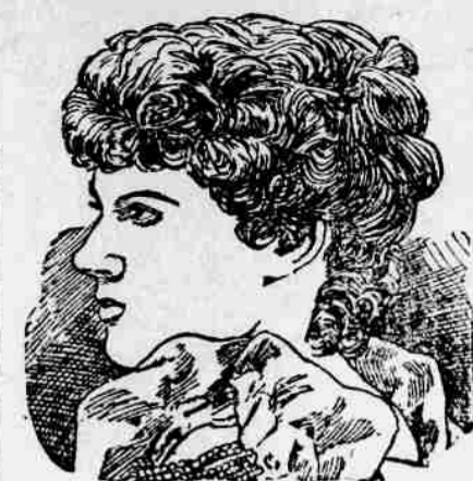
ELLA WHEELER WILCOX SAYS THIS IS THE MORAL SEASON WHEN YOU CAN REPENT AND BEGIN OVER AGAIN.