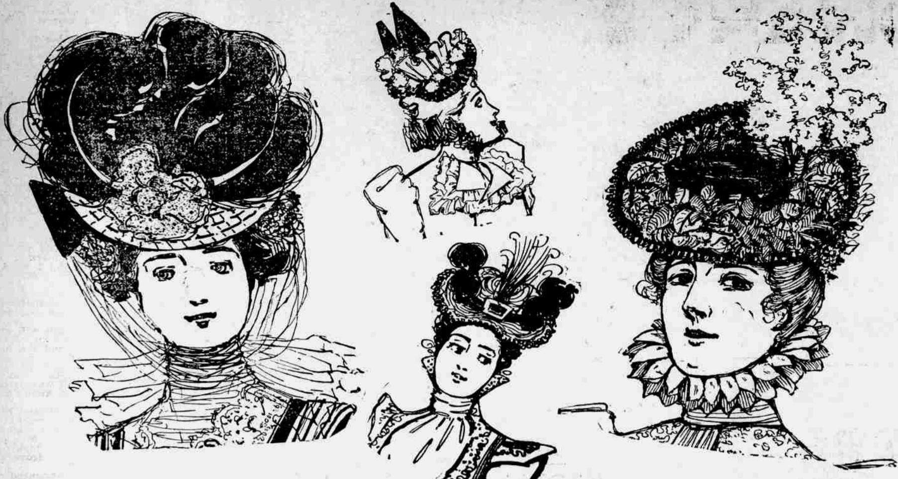
VELVET FLOWERS ARE VERY FASHIONABLE, AND SO ARE BUNCHES OF VELVET, IN FACT, VELVET IS THE MATERIAL OF THE YEAR.