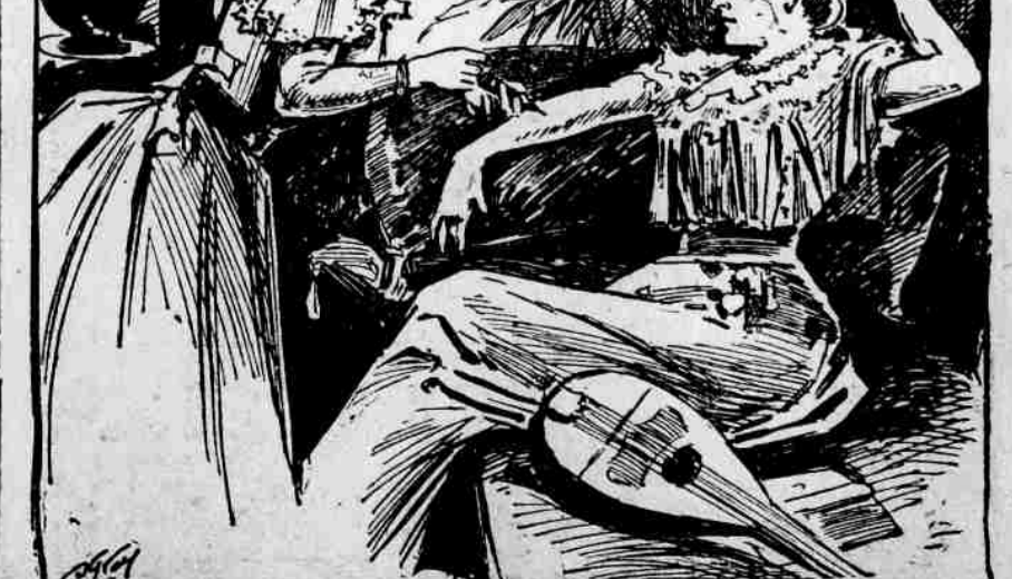
THE SOCIETY TATTOOER AT WORK WITH NEEDLE AND PIGMENTS UPON THE ARM OF HER VICTIM.

"The American flag? Of course it is popular. I do a great many flags."