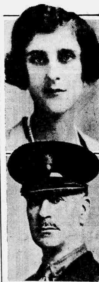
PRINCE IS THEIR GUEST —Lieutenant Colonel Sir Edward Grigg, governor of Kenya Colony, East Africa, and Lady Kathleen Grigg, are host and hostess to the Prince of Wales.