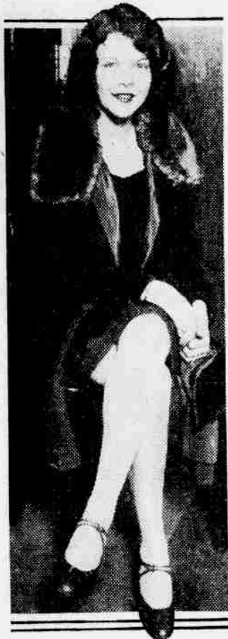
CAN'T REMEMBER WHO SHE IS —This pretty and cultured girl of 20, a victim of amnesia, has proved a puzzle to Los Angeles police. She has been unable to tell authorities her name or where she lives. She "came to" while strolling aimlessly along a street and in terror went to the police for aid in orienting herself.