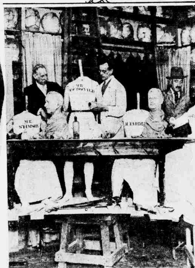
NAVAL DELEGATES IN WAX —Modeling the principal delegates to the London naval reduction conference in wax is the task of John Tussaud, left, great-grandson of the original Mme. Tussaud, at London. The models are to be grouped around a table in characteristic attitudes and placed in England's greatest wax works.