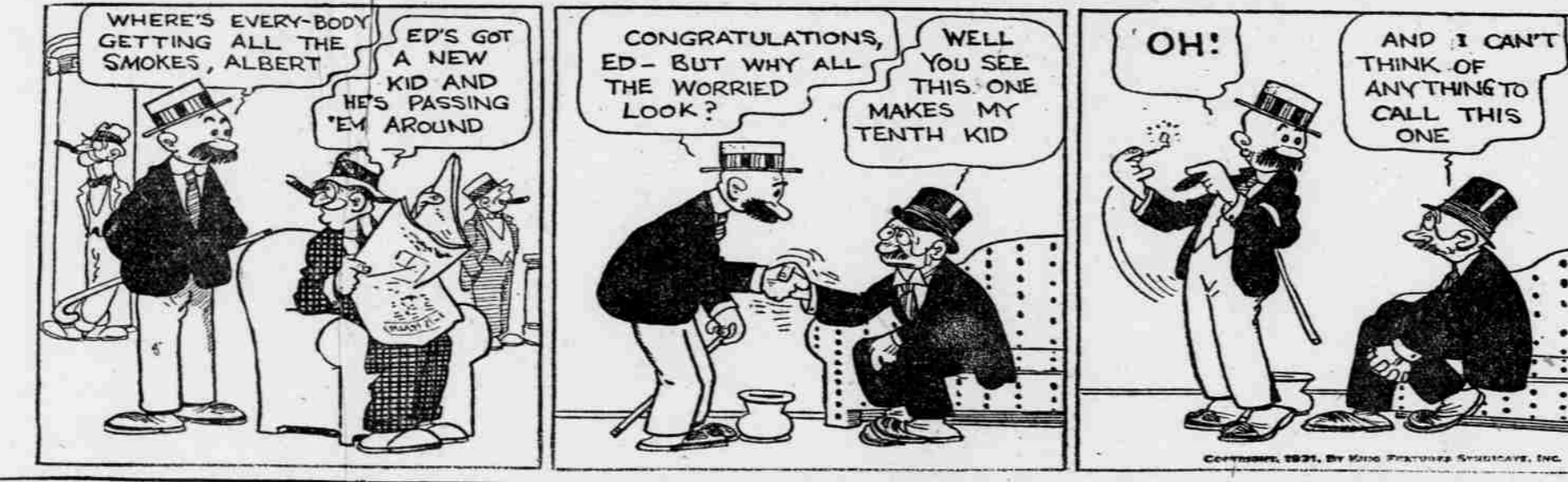
By DOK WILLARD