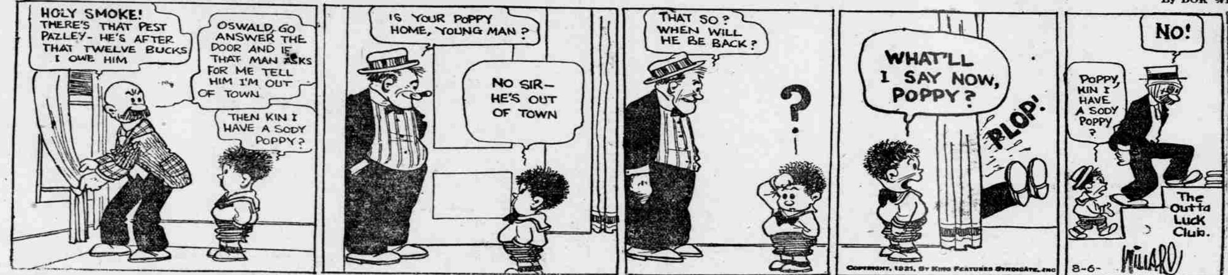
RECALCULATING FELLERS