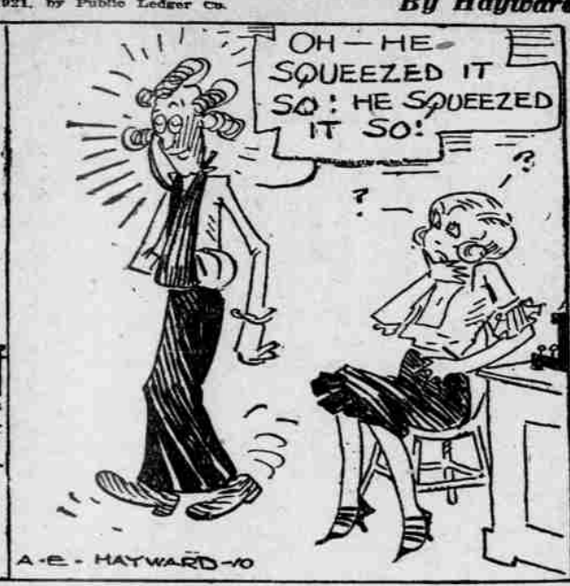
TOOTS AND CASPER—Nobody Looks at a Girl's Face Any More.