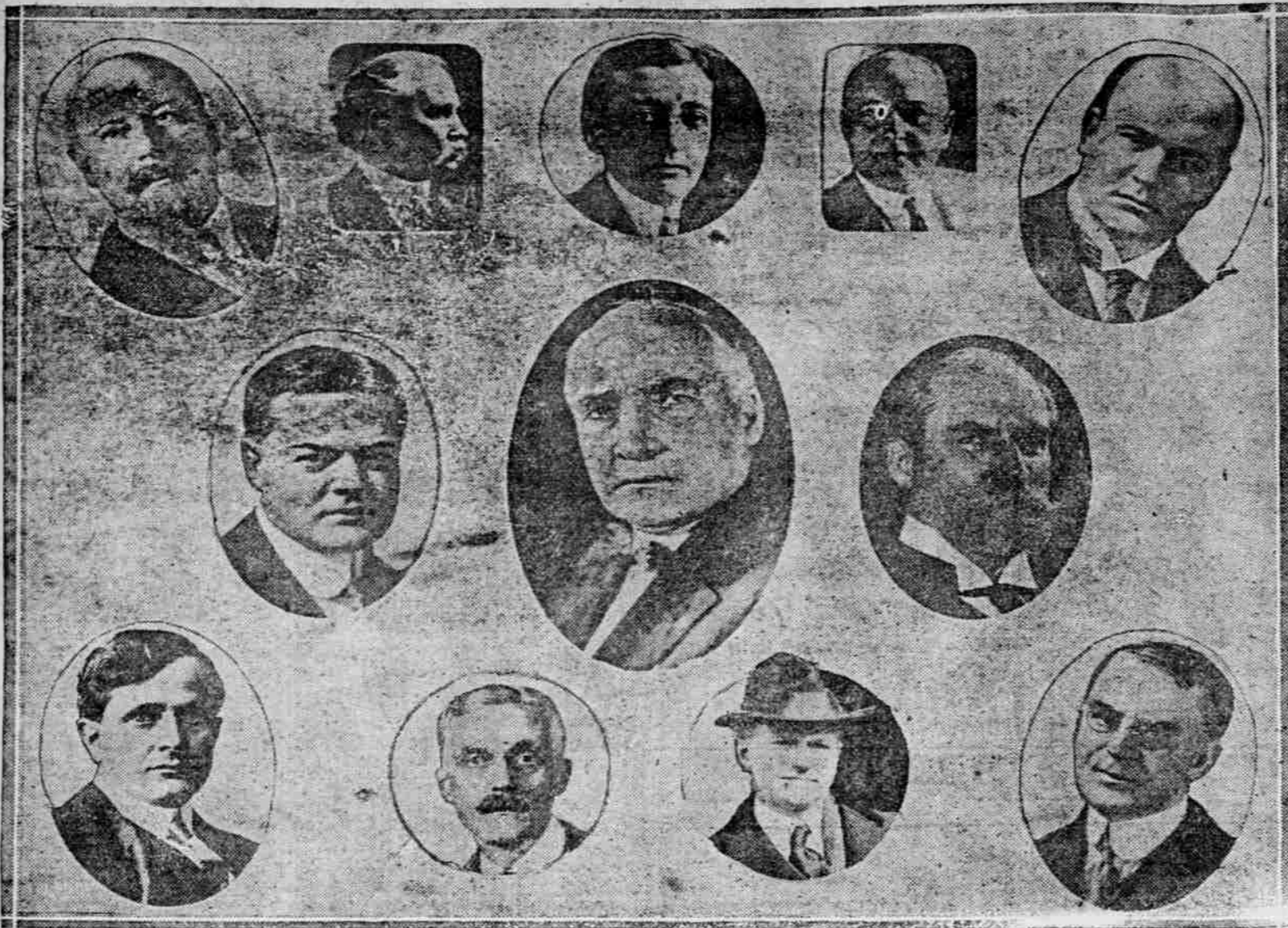
Left to right, top row, James W. Weeks, Secretary of War; Albert B. Fall, Secretary of Interior; William H. Hays, Postmaster General; Harry M. Doughtery, Attorney General, and Edwin Denby, Secretary of the Navy. Center row, left to right, Herbert Hoover, Secretary of Commerce, President-elect Harding and Charles E. Hughes, Secretary of State. Bottom row, left to right, James J. Davis, Secretary of Labor (the only member whose appointment has not yet been made official); Andrew W. Mellon, Secretary of the Treasury, Vice-President Coolidge, and Henry C. Wallace, Secretary of Agriculture.