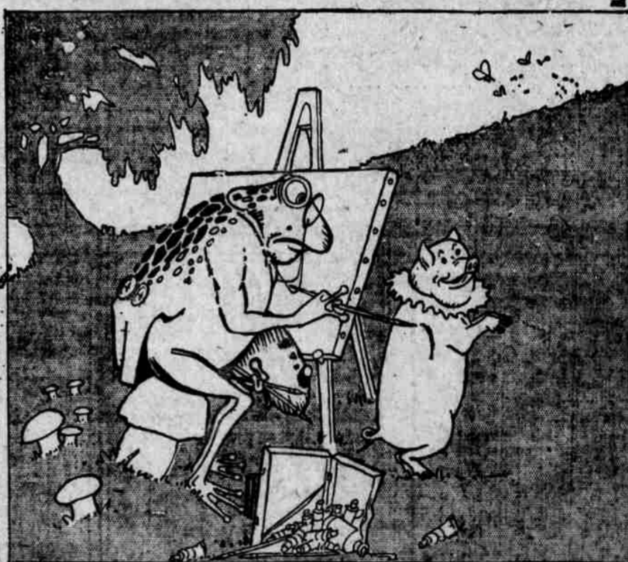
I'll get rid of This Pest, Crodunk Said.