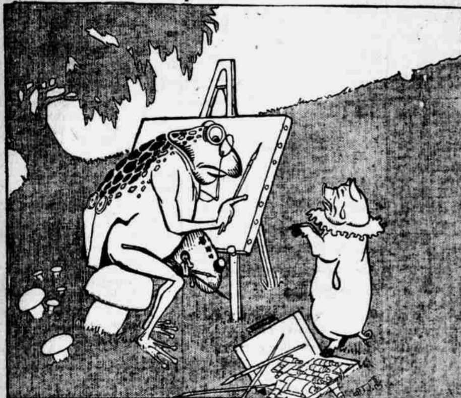
A Meddlesome Little pig was Crying.