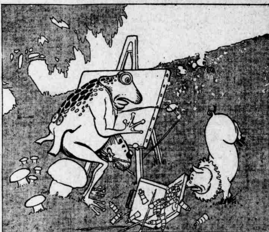
For a Sketch I am Almost Dying.