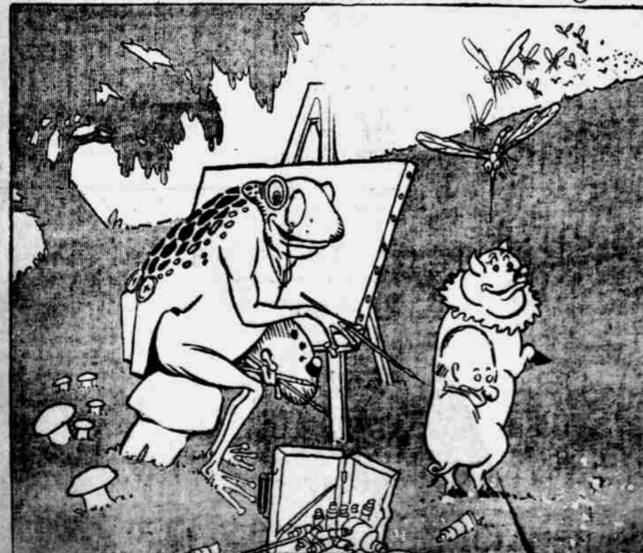
By Painting on his Back a Bald Head.