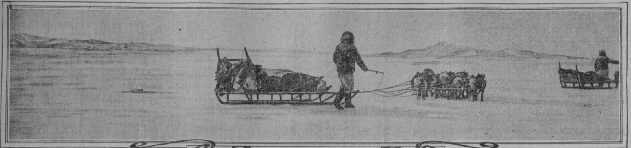
THE NEW LAND COPYRIGHT 1909 BY THE N. Y. HERALD CO. ALL RIGHTS RESERVED