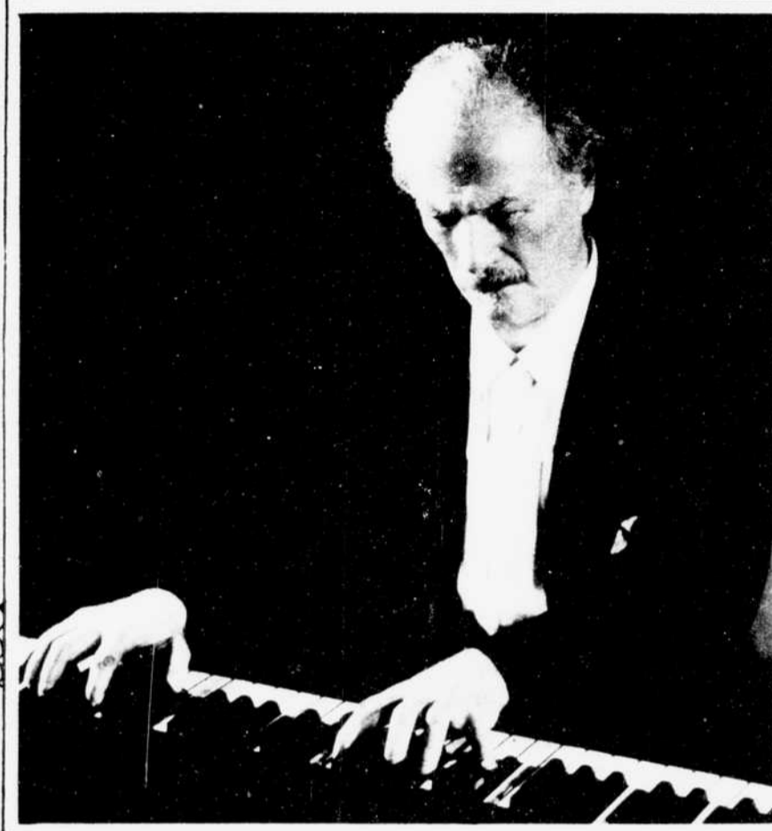
Ignace Paderewski, the great Polish pianist, who will give a concert at Constitution Hall tomorrow afternoon at 4:30 o'clock, for the benefit of the unemployed, under the patronage of Mrs. Herbert Hoover. It will be his only concert appearance here this season.