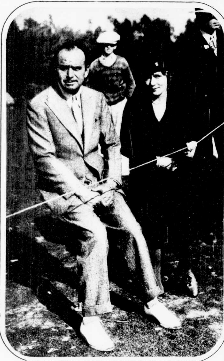
Just golf fans for a day. Douglas Fairbanks and Mary Pickford turn out with the gallery to watch the opening of the Los Angeles open golf tournament. MacDonald Smith was the winner.