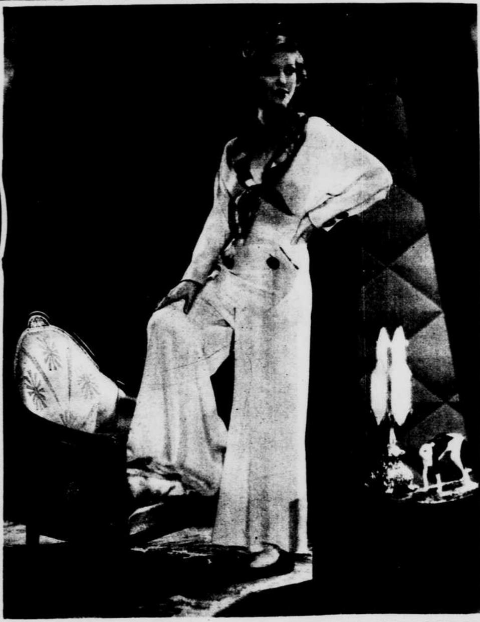
Loretta Young goes nautical in pajama styles. But you, don't have to own a 50-foot yacht to steal a hint or two from her smart outfit.