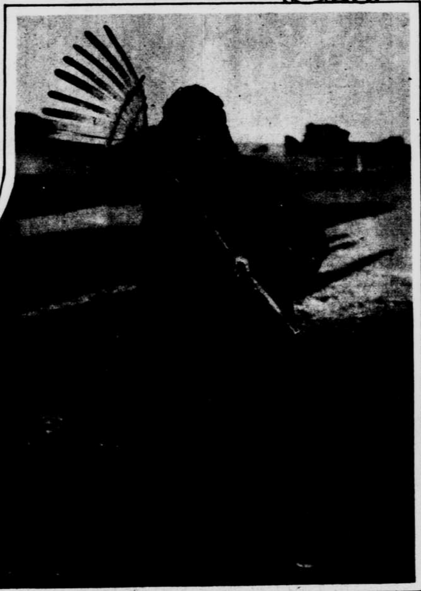
A woman tiller of the soil in Northwestern Manchukuo. The Mongolian women do most of the farm work there, using such primitive implements as this rake and wearing quilted garments for the cold climate.