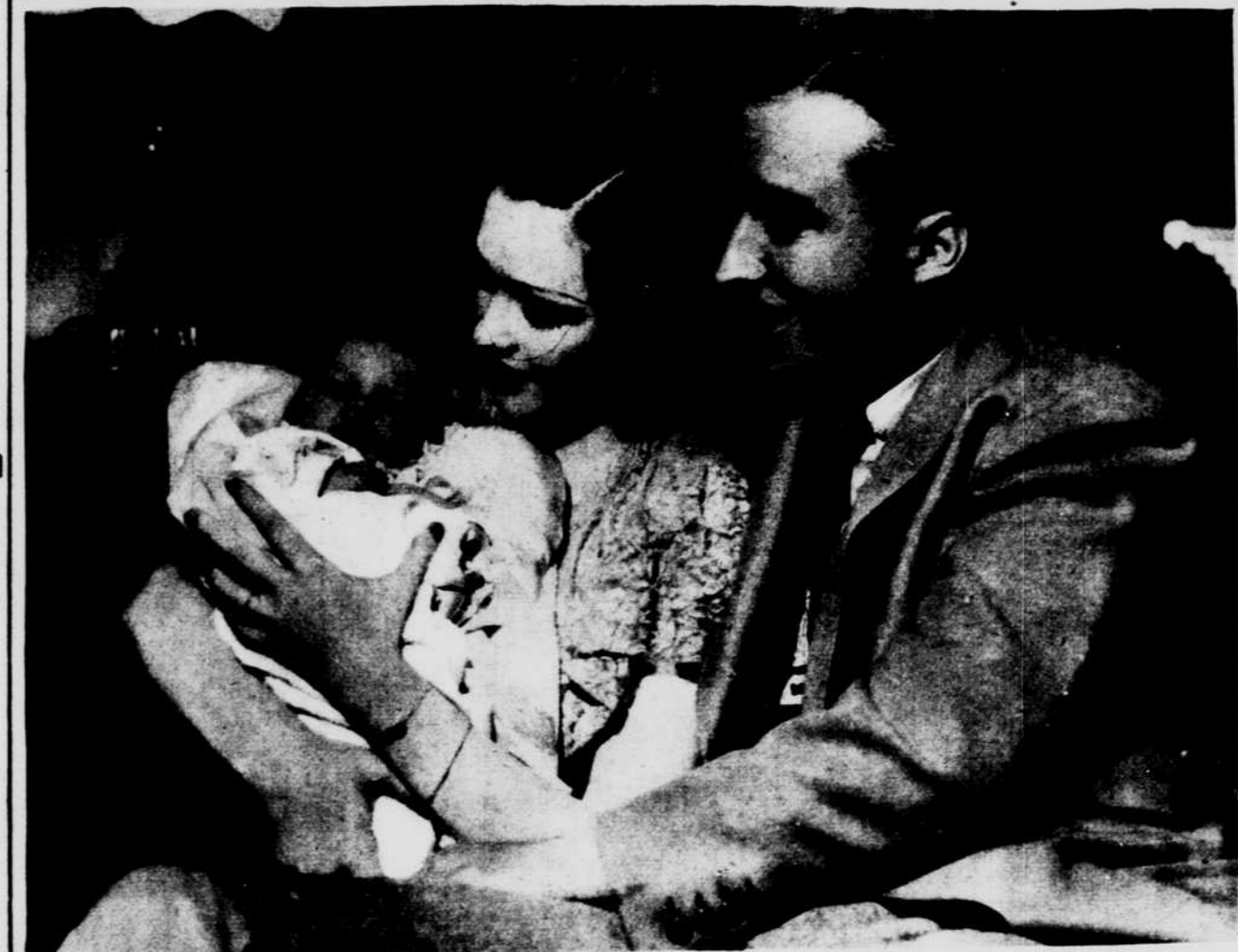
Gary Evan Crosby, three-week-old son of Bing Crosby, radio crooner, and Dixie Lee, former actress, is introduced to the big world. Photo was taken in their Los Angeles home.