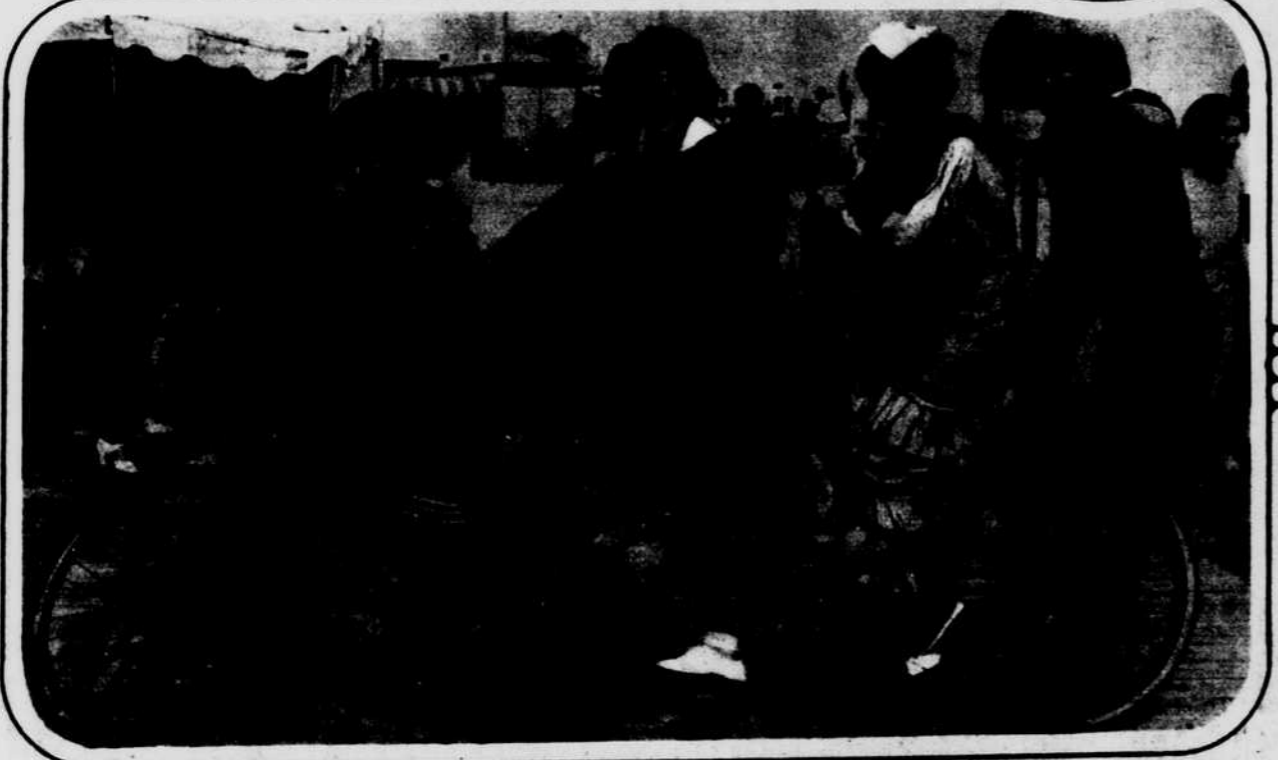
Well, well! The folks at Long Beach, Calif., were taken back a bit by this bicycle built for four and its anciently costumed bathers. They were part of a beach parade.