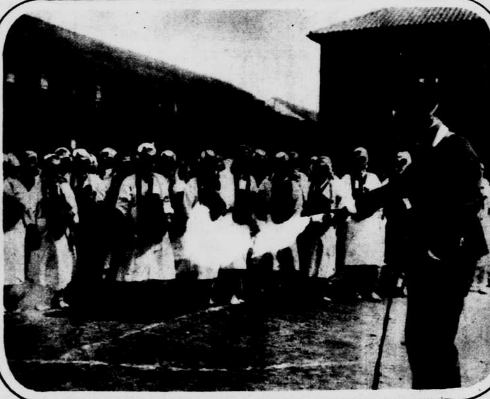
Japanese girls learn about war from soldiers. Tokio school girls are shown here braving a cloud of tear gas in a gas mask drill.