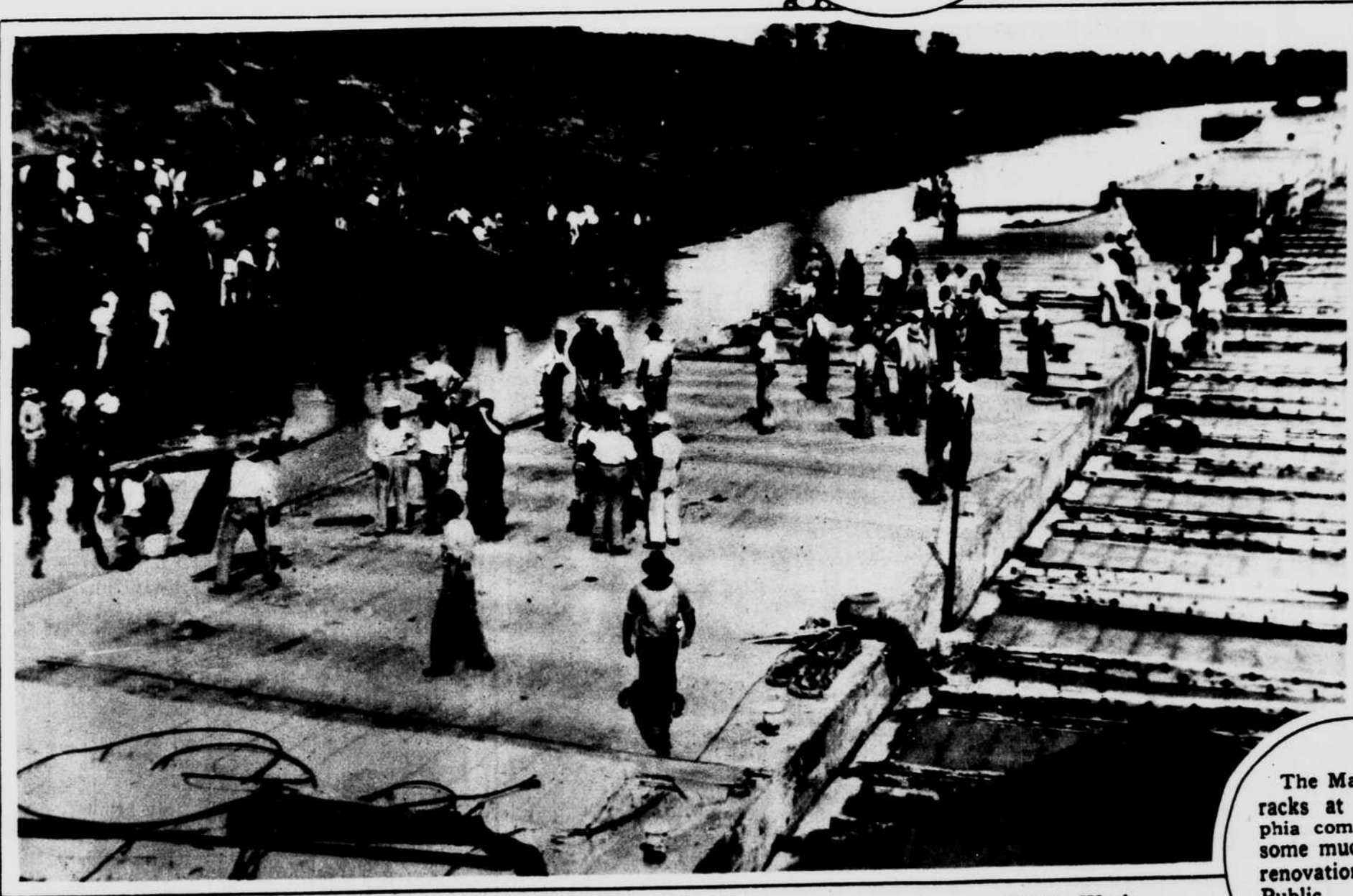
These are happier days along the Mississippi. Thousands of men are employed under Public Works allotments in curbing the old river's obstreperous ways in flood time. This shows workmen, under the direction of Army engineers, fabricating concrete mattresses at Profit Island, La.