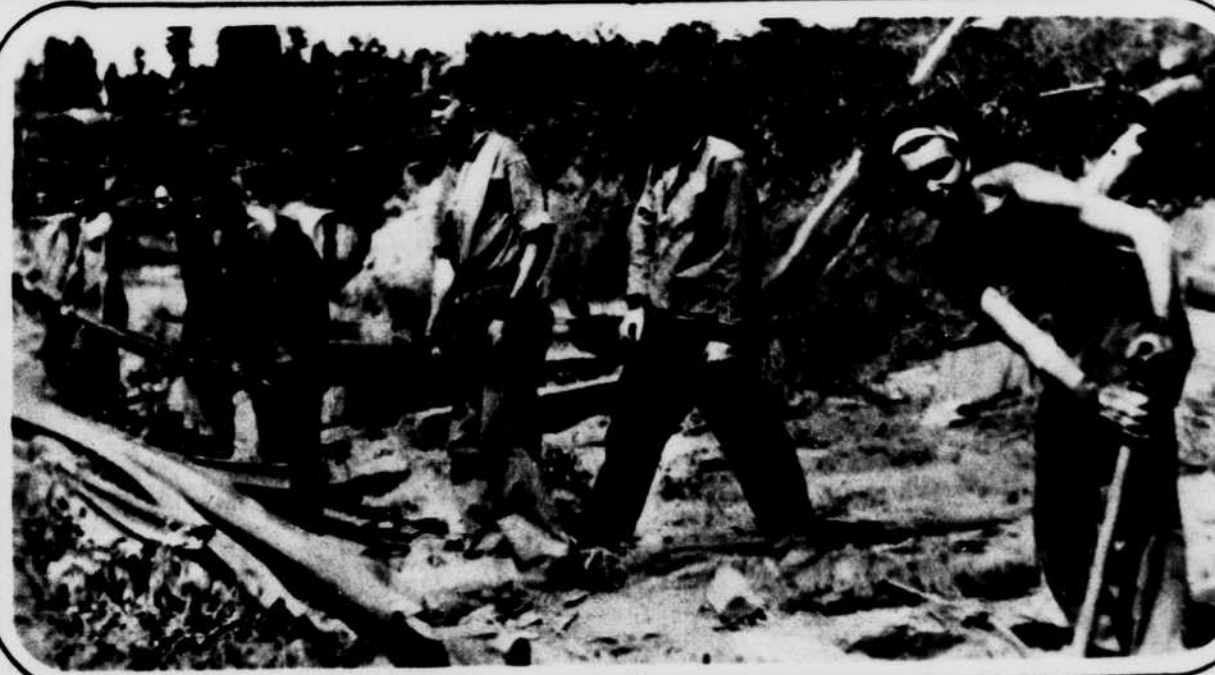
Building roads in Yosemite National Park, Calif. For all time the forests of the park will be better protected against fire by the access these roads will give to forest fire fighters.

The Marine Barracks at Philadelphia comes in for some much needed renovation with Public Works funds.