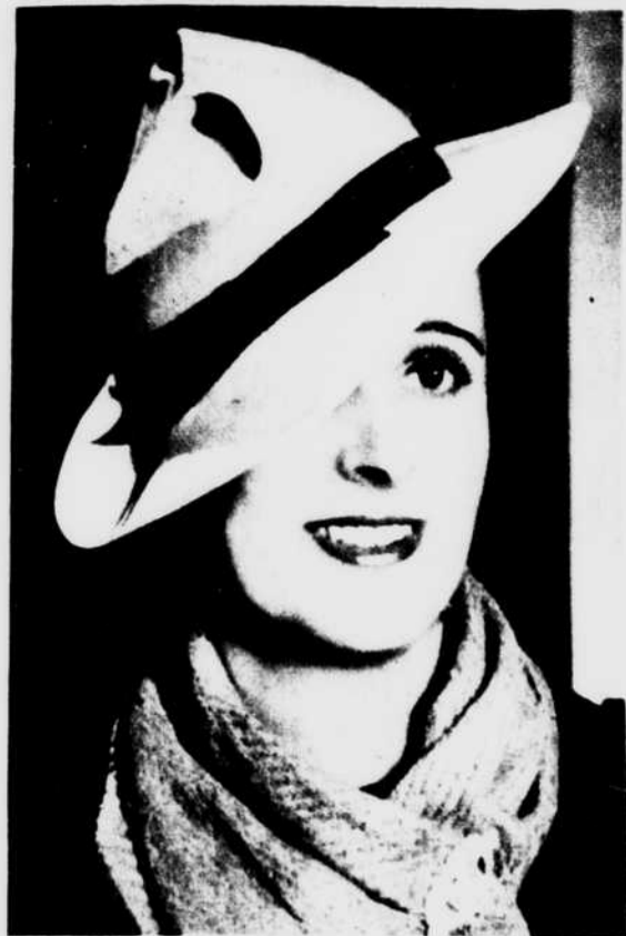
Smart for early Spring. Fashion favors this rakish hat in natural panama straw, with black grosgrain ribbon band.