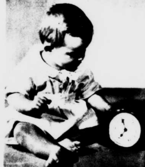
"OH, OH! EIGHT O'CLOCK! Time for me to give my mouth its morning beauty treatment with Lavoris."

ROMANCE COMES TO THOSE WHO Keep the Fragrant Mouth of Youth