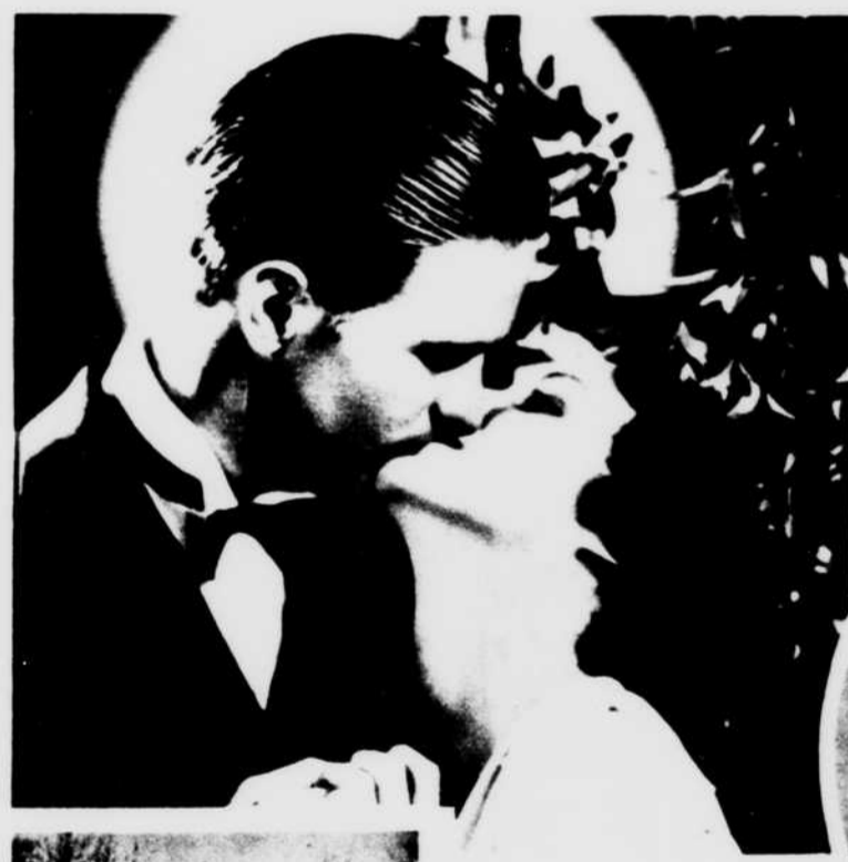
HELPS KEEP MARRIED COUPLES IN LOVE—used at least twice daily. Lavoris guards against disagreeable breath odors caused by food, liquor and tobacco.