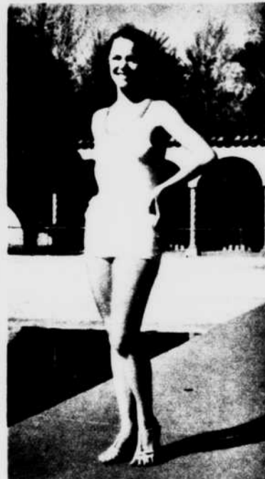
POPULAR MIAMI BEAUTY finds Lavoris helps her keep the fragrant mouth of youth.