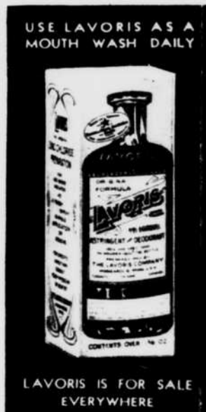
LAVORIS IS FOR SALE EVERYWHERE

Know the happiness of having the Fragrant Mouth of Youth. Get a bottle of Lavoris at once and use daily. Three sizes 4-oz., 9-oz., and 20-oz. bottles.