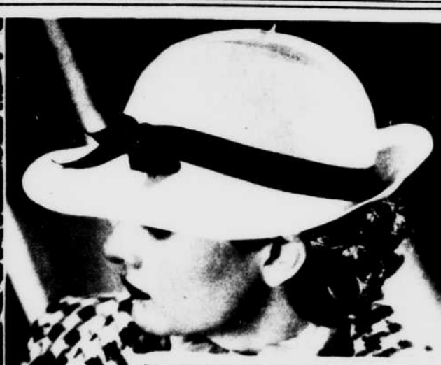
The shallow-crowned trend. One of the smart Spring hat models, designed for wear with clothes of tailored lines.