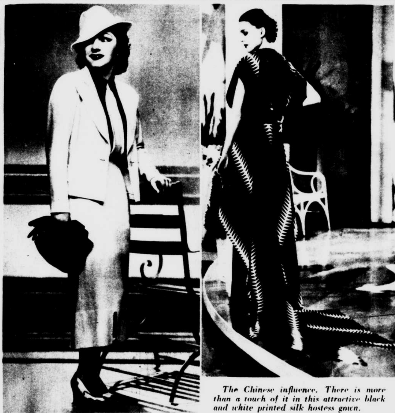
The Chinese influence. There is more than a touch of it in this attractive black and white printed silk hostess gown.