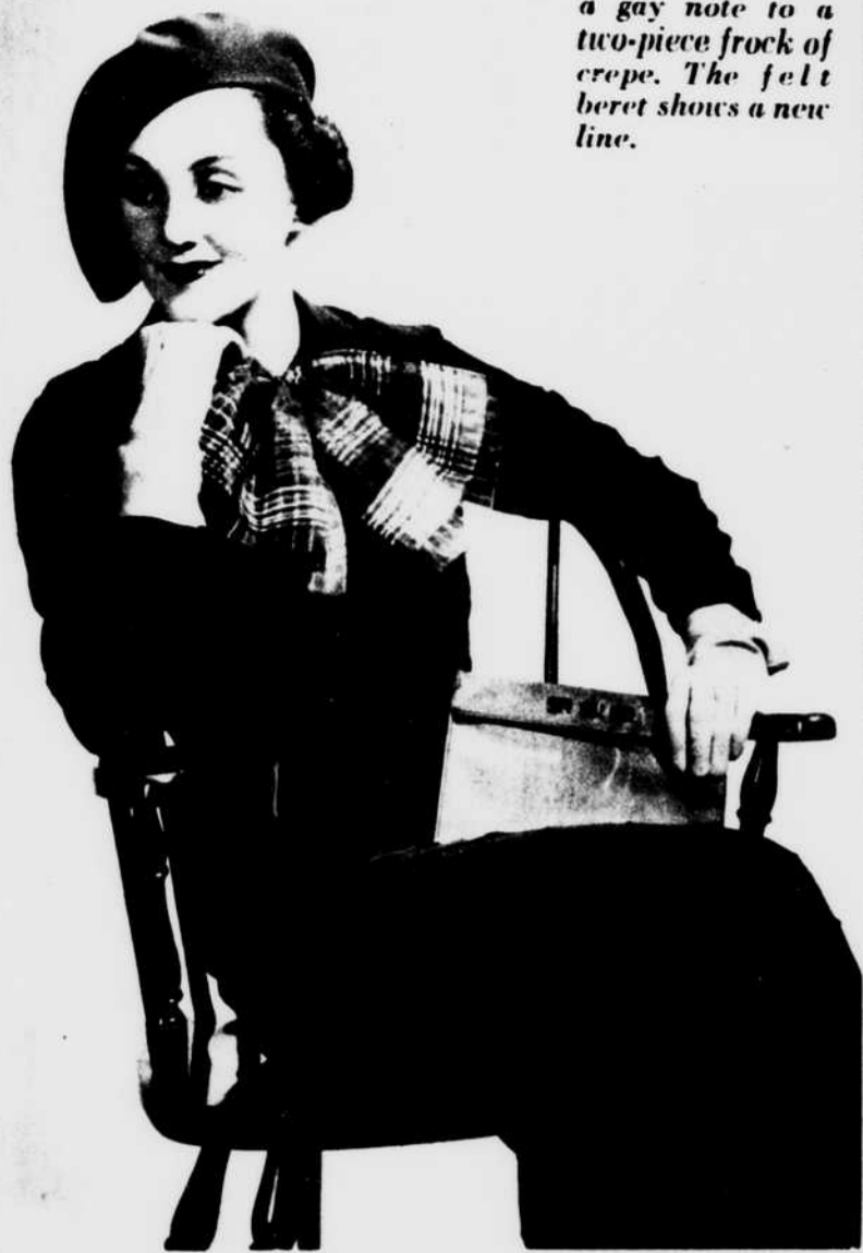
A plaid silk organdie bow adds a gay note to a two-piece frock of crepe. The felt beret shows a new line.