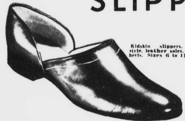
Kidskin slippers, Opera style, leather soles, rubber heels. Sizes 6 to 11.