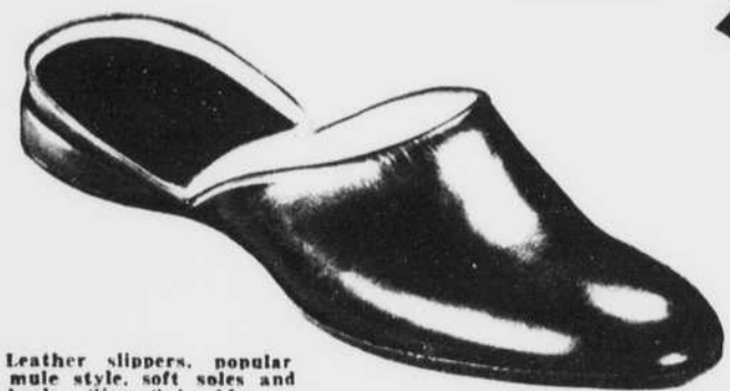
Leather slippers, popular mule style, soft soles and heels. Sizes 6 to 11.