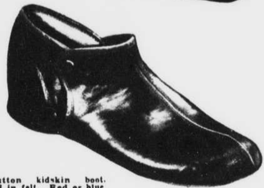
2-Button kidskin boot, lined in felt. Red or blue. Sizes 6 to 11.