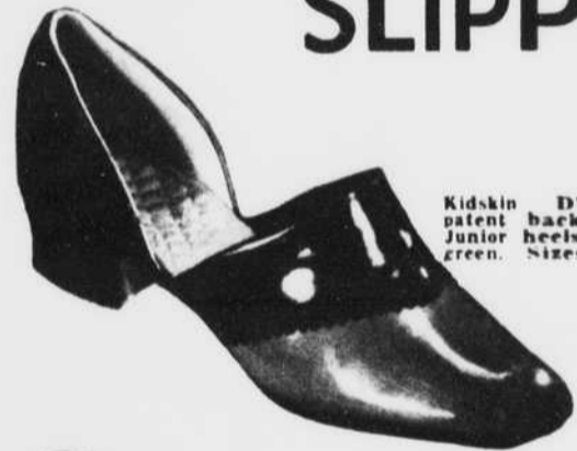
Kidskin D'Orsays with patent back and collar. Junior heels. Red, blue, green. Sizes 12 to big 7.