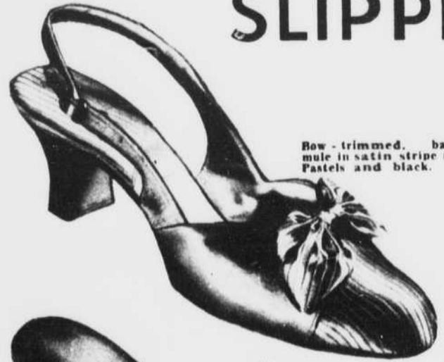
Bow-trimmed, backless mule in satin stripe rayon. Pastels and black.