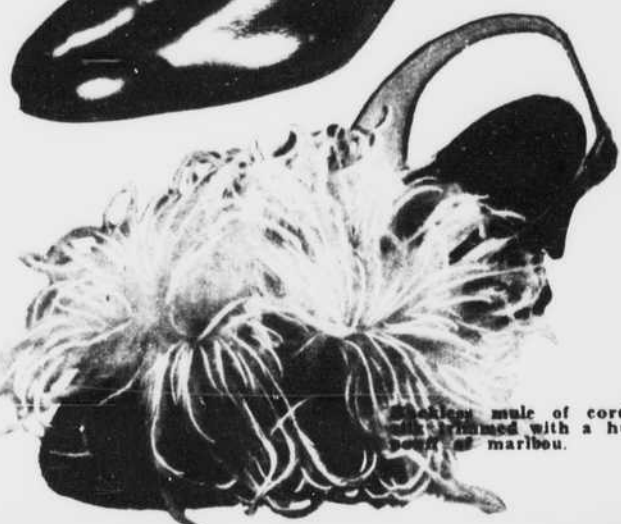
Shoes made of corded material, trimmed with a huge pom-pom of maribou.