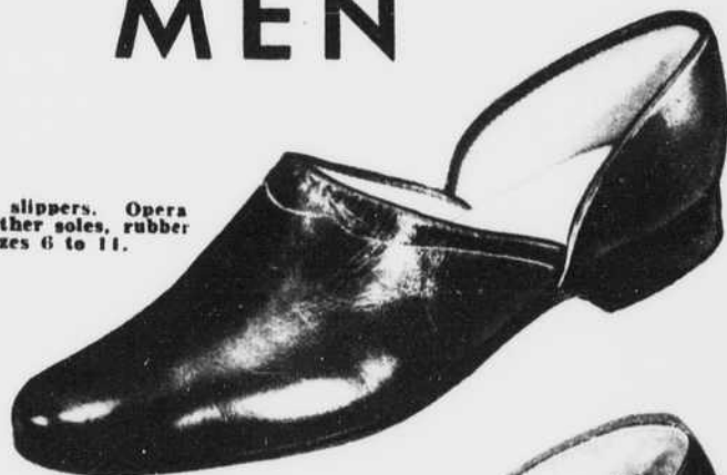
Kidskin slippers, Opera style, leather soles, rubber heels. Sizes 6 to 11.