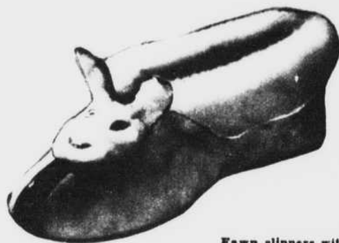
Fawn slippers with bunny-face on the vamp. Sheep lined. Sizes 4 to 3.