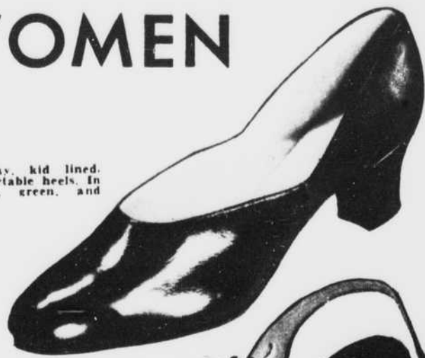
Kid D'Orsay, kid lined, with comfortable heels. In red, black, green, and blue.