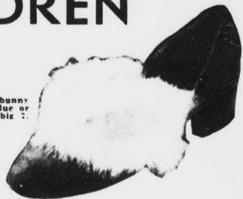
Velvet D'Orsay with bunny fur trim. In red, blue or green. Sizes 12 to big 7.