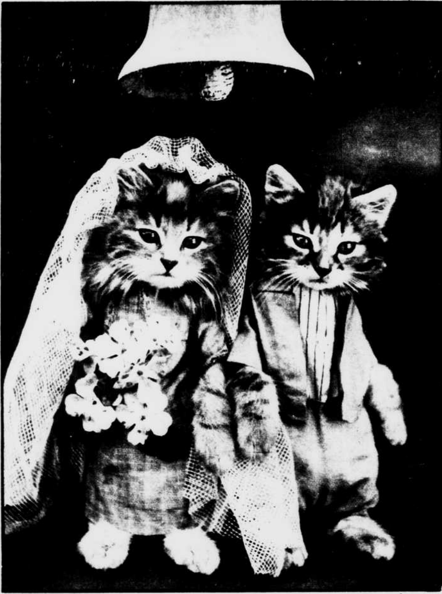
THE wedding of Miss Furry Mew! The wedding of the year! The happy bride looks very sweet beside her lover dear. The bridegroom doesn't look so sweet (bridegrooms never do), But that's a thing we mustn't hint to fond Miss Furry Mew!