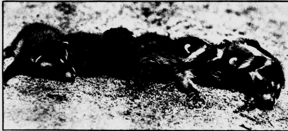
Left: AND STILL MORE QUINTS. These strange little babies are 6-week-old raccoons, who have a "chain gang" formation all their own. They were found near Swansea, Mass.