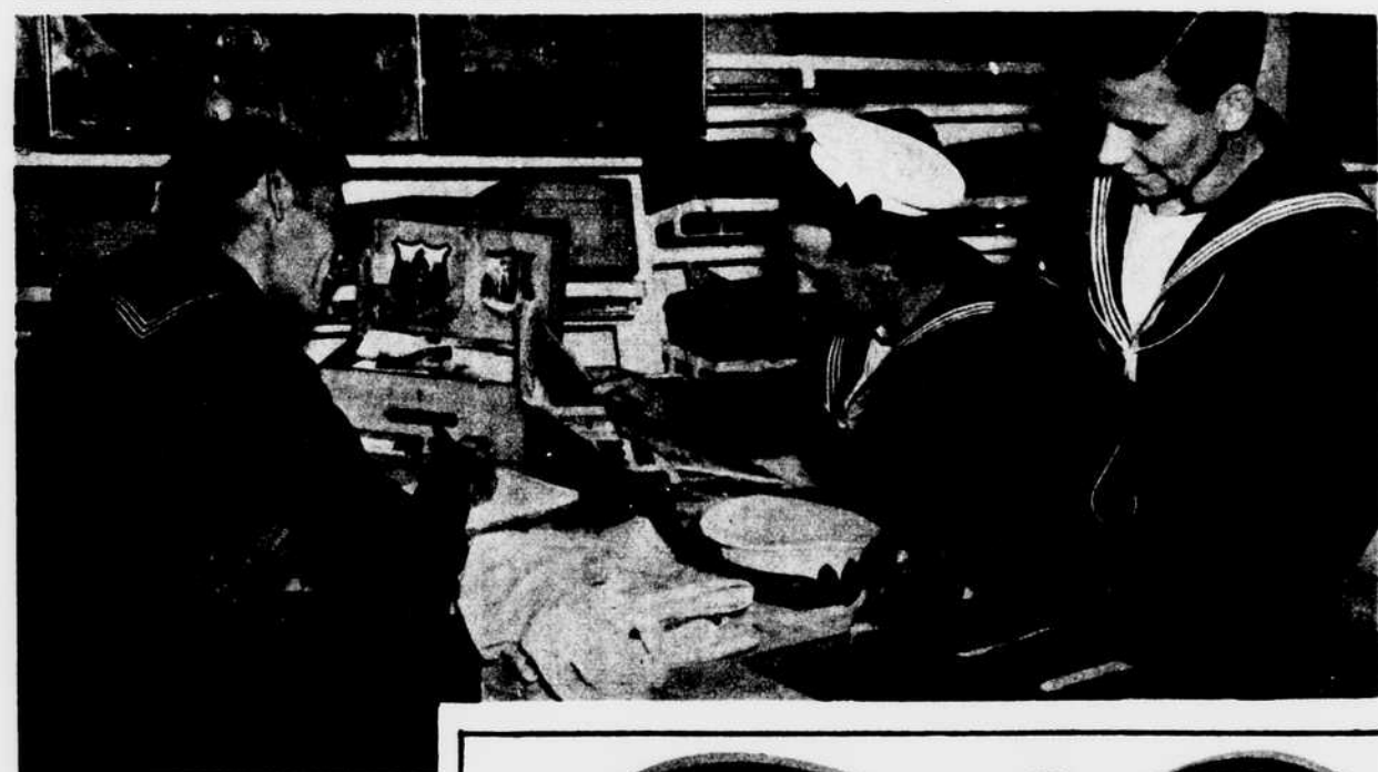
British tars aboard H. M. S. Berwick, British cruiser at New York for the World's Fair, read about the fair, write home about it, and get ready to see more of it with a bit of "home" laundry.