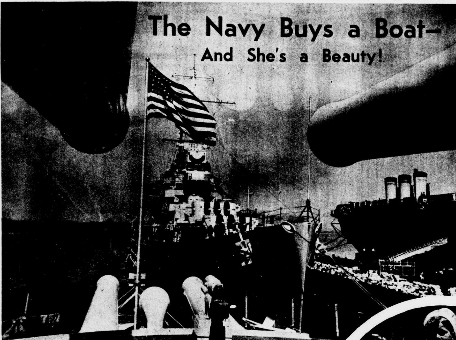
She's in the Navy now. Commissioned the other day at Norfolk, Va., here's the proud new cruiser St. Louis framed between guns of the U. S. S. New York during the commissioning ceremonies.