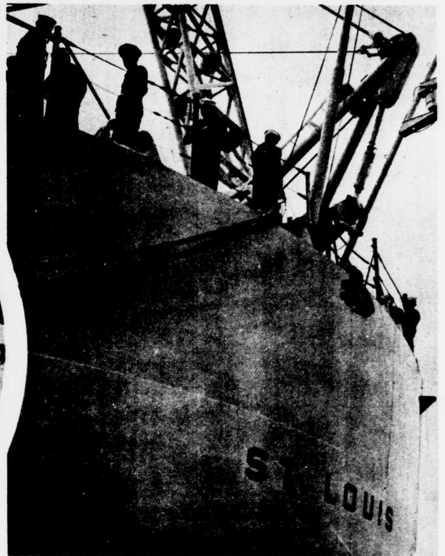
No doubt about her name. And the new St. Louis is the fourth warship to bear it in the evolution of Uncle Sam's Navy.