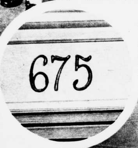
← Entrance to the Ambassador's residence, Suite 675. The establishment of the Uruguayan Embassy in a suitable house is not expected until after the war. Several apartments on the 6th floor of the hotel, however, are occupied by the family, and the Embassy offices are located on the third floor.