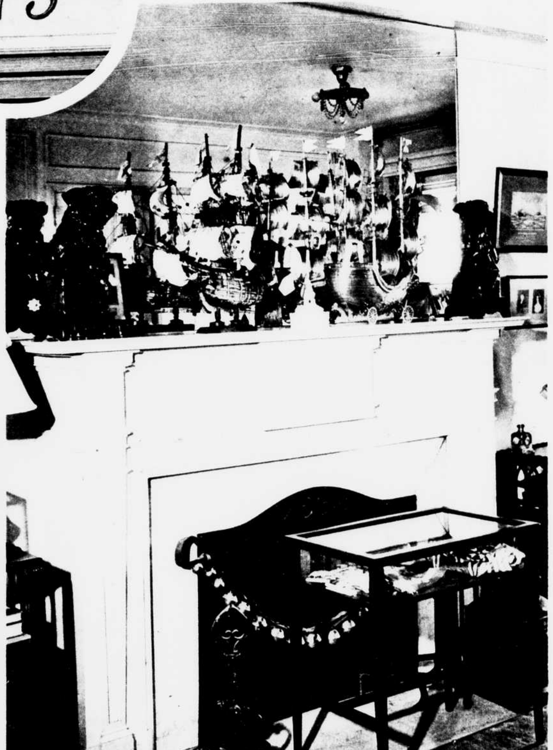
The glass case in front of the fireplace contains the Ambassador's many decorations, including the Grand Cross of the Legion of Honor, France's highest award. An old copy of the Mayflower rests on the mantel (left), with amber jade figures on either end.